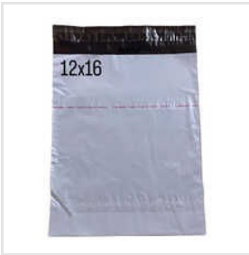
Pod Courier Pouch