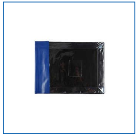
BLUE BMR DOCKET BAGS