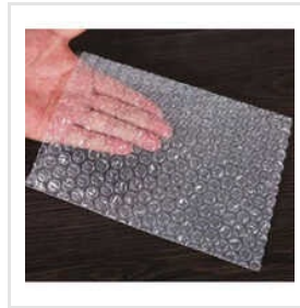
Bubble Wrap Pouch