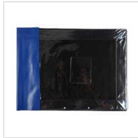
Blue BMR Docket Bags