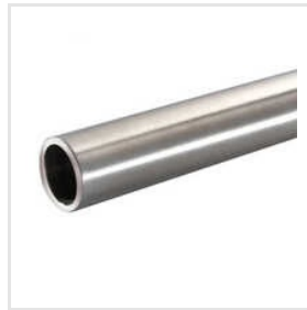
Stainless Steel 316l Round Pipe