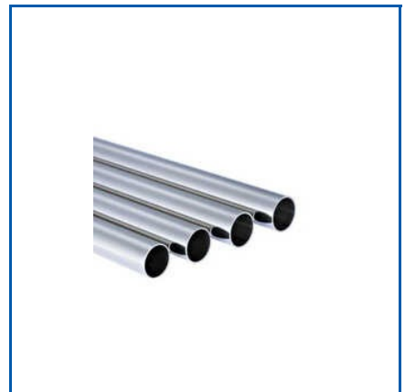
316 SEAMLESS STAINLESS STEEL ROUND PIPE