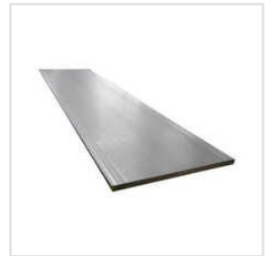
202 Stainless Steel 2b Sheet