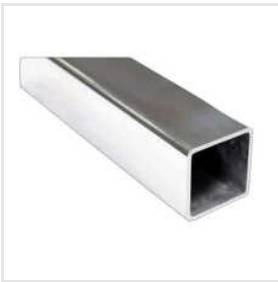
202 Stainless Steel Square Pipe