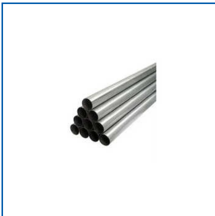
202 STAINLESS STEEL ROUND PIPE

202 Stainless Steel 2b Sheet, 202 Stainless Steel Hex Bar, 202 Stainless Steel Rectangular Pipe, 202 Stainless Steel Round Bar, 202 Stainless Steel Round Pipe, 202 Stainless Steel Square Pipe, 304 Stainless Steel Hex Bar, 304 Stainless Steel Rectangular Pipe, 304 Stainless Steel Round Bar, 304 Stainless Steel Square Pipe, 304l Stainless Steel Square Pipe, 316 Seamless Stainless Steel Round Pipe, 316 Stainless Steel 2b Sheet, 316 Stainless Steel Hex Bar, 316 Stainless Steel Polished Sheet, etc.