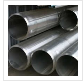
Jindal Stainless Steel 202 Welded Pipe