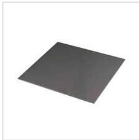
Stainless Steel 304 2b Sheet