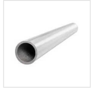
Stainless Steel 3041 Round Pipe