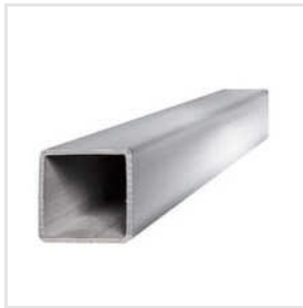
316 Stainless Steel Square Pipe