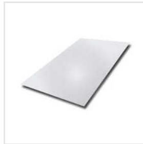
316 Stainless Steel 2b Sheet