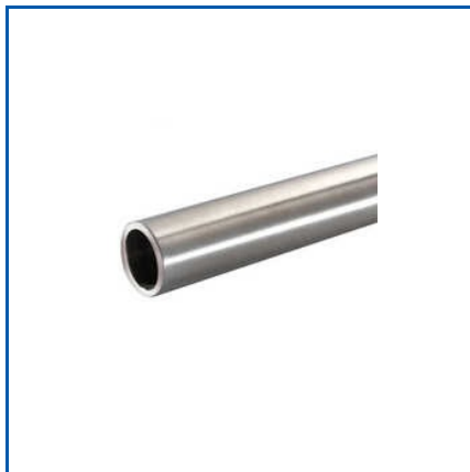
316 STAINLESS STEEL ROUND PIPE