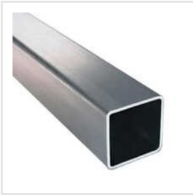
304l Stainless Steel Square Pipe