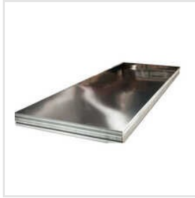
316 Stainless Steel Polished Sheet