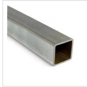
Jindal Stainless Steel 202 Square Pipe