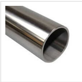
Stainless Steel Round Welded Pipe