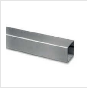
Jindal Stainless Steel 304 Square Pipe