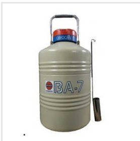
BA-7 Liquid Nitrogen Container Cryocan