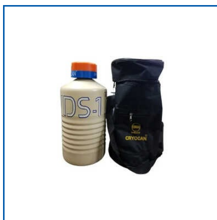
IDS 1 NITROGEN CONTAINER