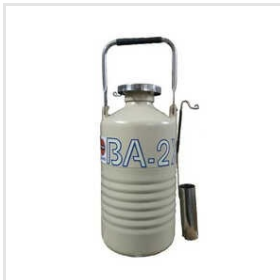
BA-2X Nitrogen Container