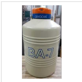
BA-7 Liquid Nitrogen Container