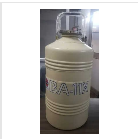
BA 11X Nitrogen Container