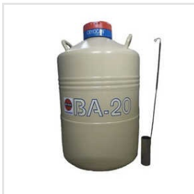
Ba-20 Liquid Nitrogen Container Cryocan