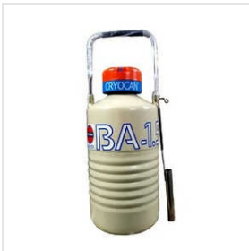
BA 1.5 Nitrogen Container