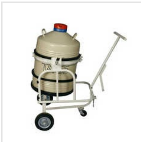
Cryocan Mild Steel Liquid Nitrogen