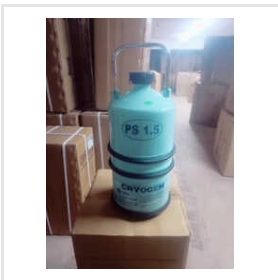
PS-1.5 Liquid Nitrogen Container