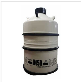
Liquid Nitrogen Cryogenic Containers