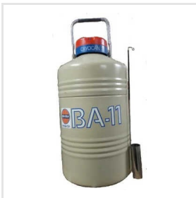
BA-11 Cryocan Liquid Nitrogen Container