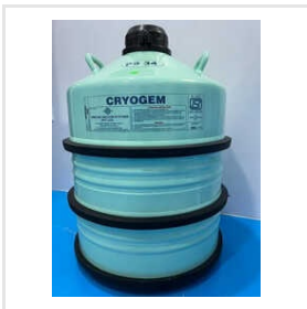
Ps 34 Liquid Nitrogen Container Cryocan