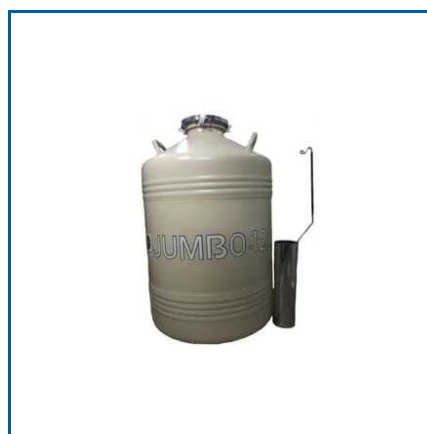
J-12 LIQUID NITROGEN CONTAINER