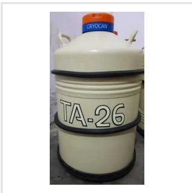
TA-26 Liquid Nitrogen Container