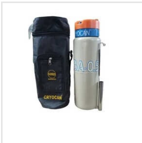
BA 0.5 Nitrogen Container