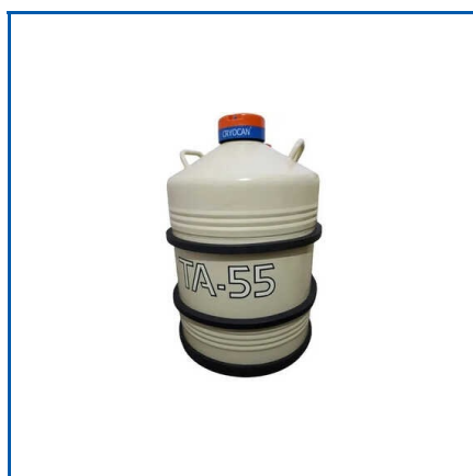
TA-55 LIQUID NITROGEN CONTAINER CRYOCAN

9 Inch Stainless Steel Castrator, AI Gloves LDPE, Acetylene Gas Cylinder, Argon Gas Cylinder, Argon Industrial Gas, BA 0.5 Nitrogen Container, BA 1.5 Nitrogen Container, BA 11X Nitrogen Container, BA 7 Nitrogen Container, BA-11 Cryocan Liquid Nitrogen Container, BA-2X Nitrogen Container, BA-7 Liquid Nitrogen Container Cryocan, BA-7 Liquid Nitrogen Container, Ba-20 Liquid Nitrogen Container Cryocan, Brass A.I Lock Gun, etc.