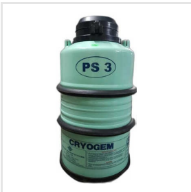
PRECISE PS-3 Cryogem Liquid Nitrogen