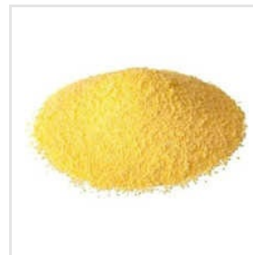
Industrial Grade Sulphur Powder