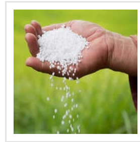
Technical Grade Urea