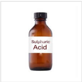
Dilute Sulphuric Acid