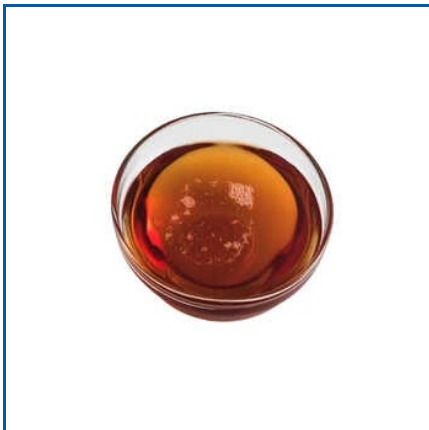
TURKEY RED OIL

30mm Metallurgical Coke, 60% CP Grade Nitric Acid, Acetic Acid Chemical, Ammonia Solution, Black Metallurgical Coke, Boric Acid Powder, Copper Sulphate Powder And Crystal, Dilute Sulphuric Acid, Diluted Nitric Acid, Fulvic Acid Powder, Gacl Hydrogen Peroxide, Green Phosphoric Acid, Hydrochloric Acid, Hydrogen Peroxide Solution, Industrial Acid Slurry, etc.