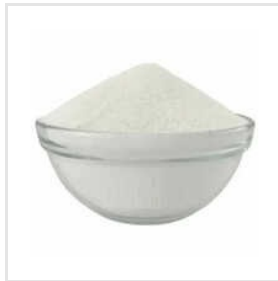
Boric Acid Powder