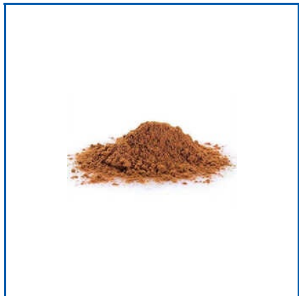
FULVIC ACID POWDER