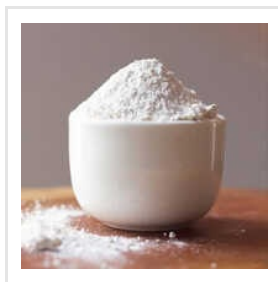
Sodium Sulphate Powder