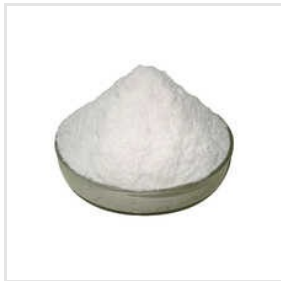
Zinc Sulphate Powder