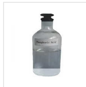
Spent Phosphoric Acid