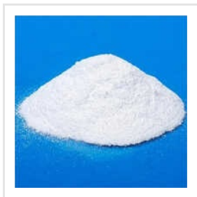
Magnesium Sulphate Powder