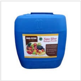
Nano Silver Hydrogen Peroxide