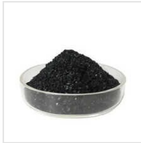
Potassium Humate Shiny Flakes