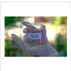
Hydrogen Peroxide Solution