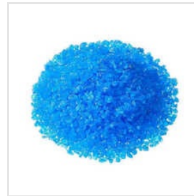
Copper Sulphate Powder And Crystal