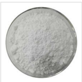
Soda Ash Powder