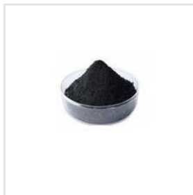
Seaweed Extract Powder