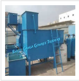
ETP For Industrial Use