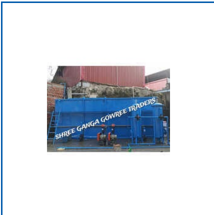
EFFLUENT TREATMENT PLANT 1000 KLD