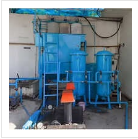
Daying Water Effluent Treatment Plant