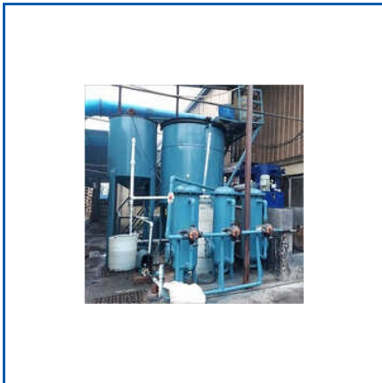
ACIDIC EFFLUENT TREATMENT PLANT

Acidic Effluent Treatment Plant, Acidic effluent Treatment Plant, Biological ETP, Biological Effluent Treatment Plant, Coloring Effluent Treatment Plant, Daying Water Effluent Treatment Plant, ETP For Construction Site, ETP For Food And Beverages, ETP For Industrial Use, Effluent Treatment Plant 1 KLD – 1.5 MLD, Effluent Treatment Plant 1000 KLD, Effluent Treatment Plant 50 KLD, Grey Water Effluent Treatment Plant, Hospital Industry Effluent Water Treatment Plant, Industrial Effluent Treatment Plant, etc.