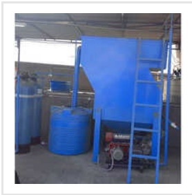
Grey Water Effluent Treatment Plant