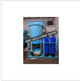
Skid Mounted Effluent Treatment Plant