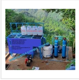
Acidic Effluent Treatment Plant