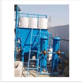
Hospital Industry Effluent Water