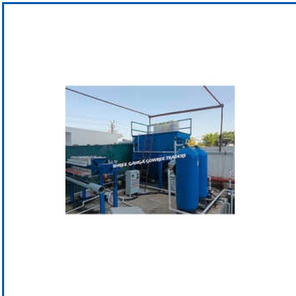
EFFLUENT TREATMENT PLANT 50 KLD