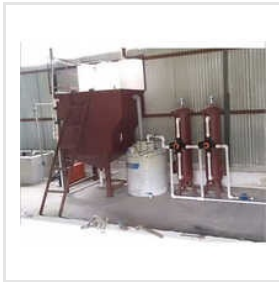
Industrial Effluent Treatment Plant