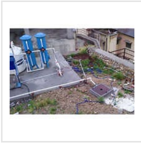
Biological Effluent Treatment Plant