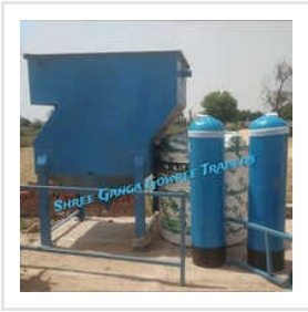
ETP For Construction Site