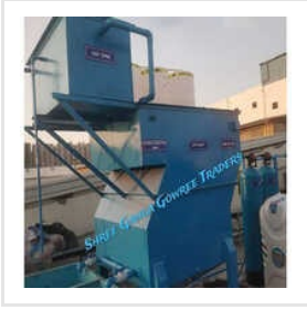
ETP For Food And Beverages