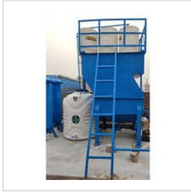
Coloring Effluent Treatment Plant