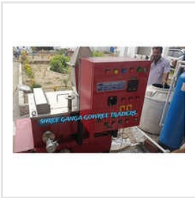
Effluent Treatment Plant 1 KLD - 1.5 MLD