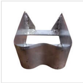
W-Cut Die Punch