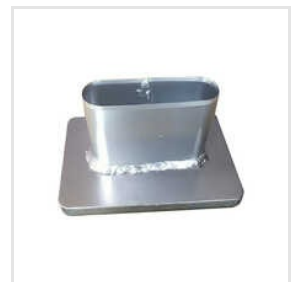
D-Cut Die Punch