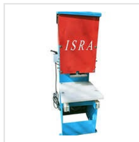
W-Cut Punching Machine