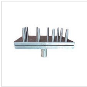
Hole Die Punch