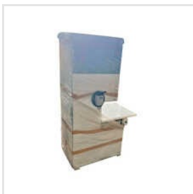
U-Cut Punching Machine