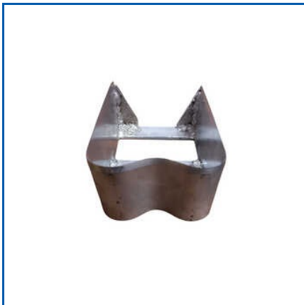
W-CUT DIE PUNCH

3D Cut Punching Machine, Anti Static Generator Bar, D-Cut Die Punch, Hole Die Punch, Rotogravure Printing Machine, U-Cut Punching Machine, W-Cut Die Punch, W-Cut Punching Machine, etc.