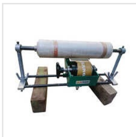
Rotogravure Printing Machine