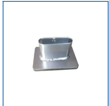
D-CUT DIE PUNCH