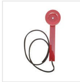
Anti Static Generator Bar