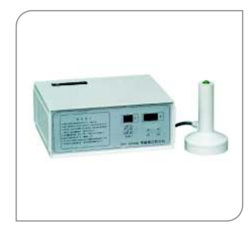
Manual Induction Sealers