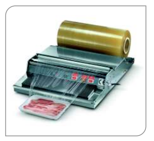
For Fruits, Food & Meat Packaging