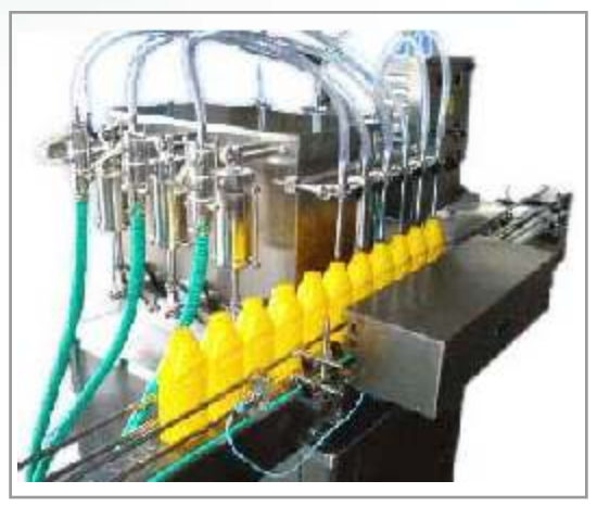
Automatic Liquid Filling Machine ( Multi Head)