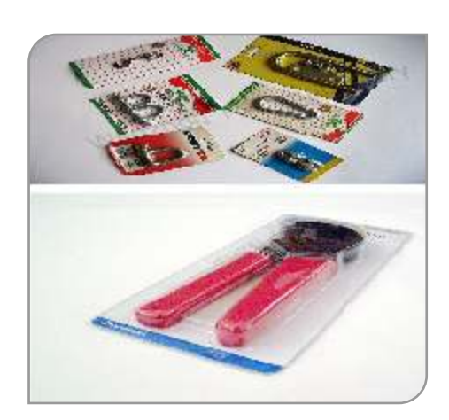
Blister Packaging Machines