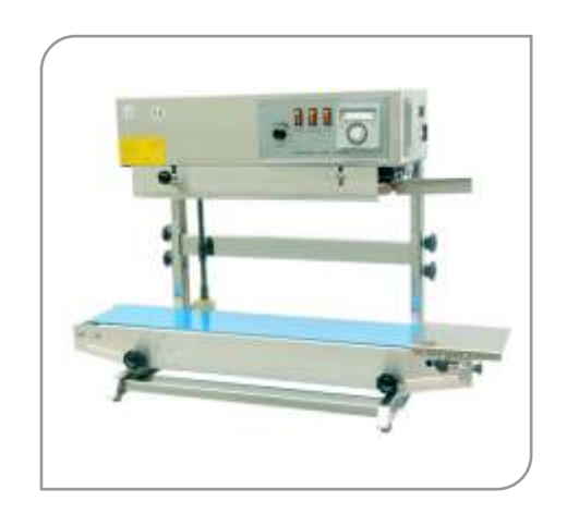
Vertical Continuous Band Sealers