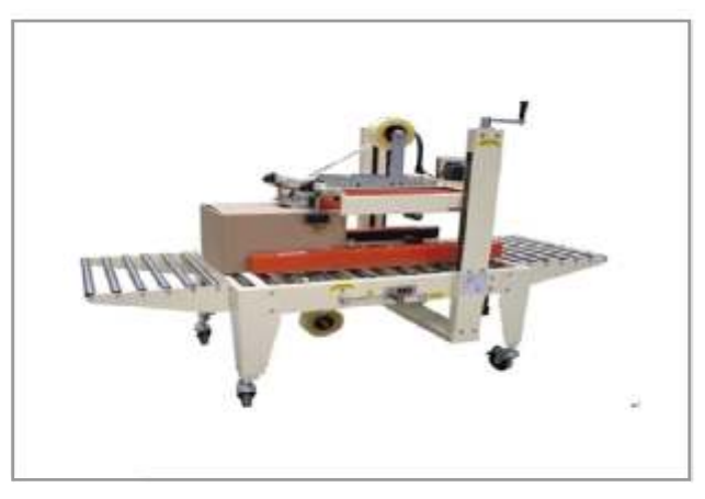
Carton Taping Machine with Top and Bottom Drive