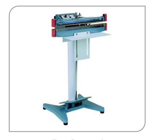
Foot Operated Sealing Machines