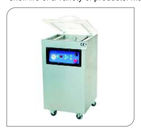
Single Chamber Vacuum Packaging Machines

Create high vacuum condition and seals vacuum pouches to lengthen the shelf life of a variety of products. Machines on Stock and ready to ship.