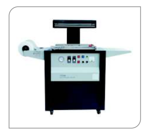
Skin Packaging Machines

The application of a skin packaging system allows adhering film to a printed paper board or other surfaces, like carton, plastic or aluminium; for the purpose of packaging a product for display, shipping or protection. The cavity or pocket contains the product and the lid seals the product in the package.