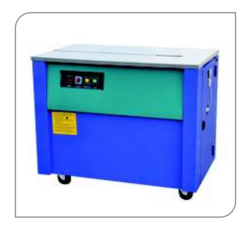
Semi Automatic Strapping Machines