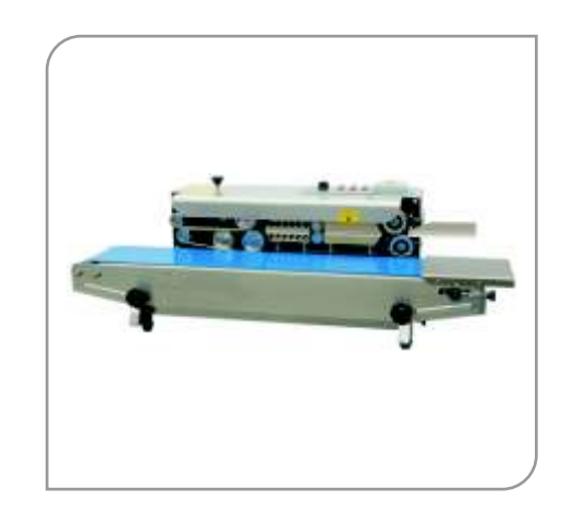
Horizantal Continuous Band Sealers

We offer our wide selection of heat sealers: affordable price for an excellent quality. Each unit features heavy duty electronic components in a rugged metal body design. Some models, mainly used for the food industry, feature a stainless steel design. Impulse Sealers, constant heat designs as well as the very popular Continuous Band Sealers are among the machines which can be found here.