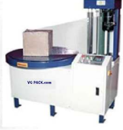
Pallet Stretch Wrapping Machine Standard Models