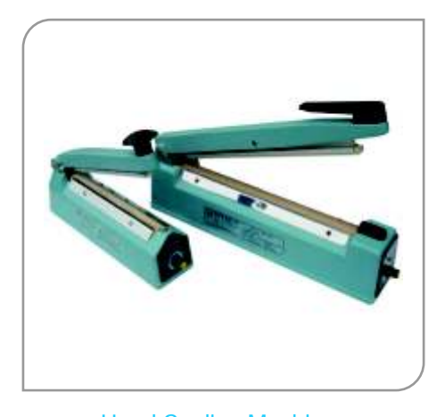
Hand Sealing Machines