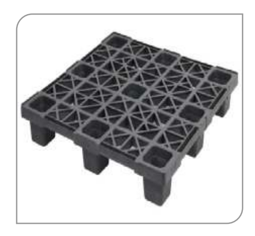
Export Plastic Pallets