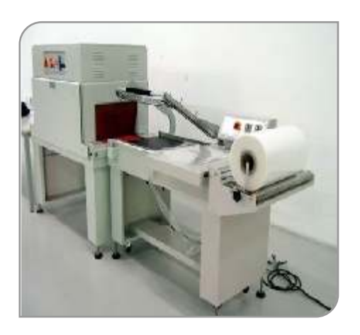
L Sealer Cum Tunnel (Combo Model)