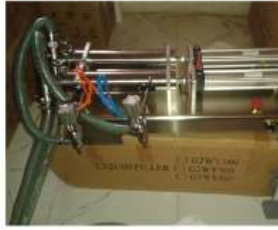
Liquid Filling Machine Double Head