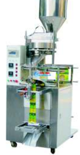
Form Fill Seal Machines