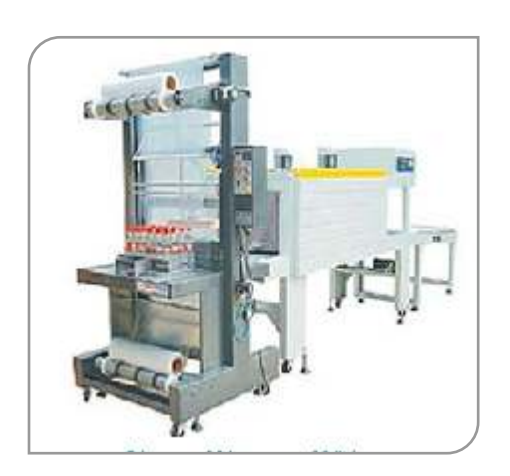
Sleeve Wrapper With Shrink Tunnel