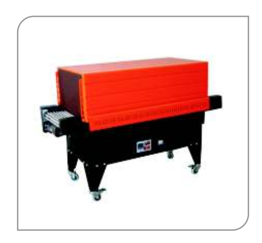
Medium Duty Shrink Tunnel