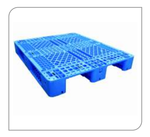
HDPE InjectionMolded Plastic Pallets

We 'VG Pack,' are amongst the leading companies engaged in supplying innovative range of Industrial Plastic pallets. The offered product range includes Molded Plastic Pallets, HDPE Plastic Pallets. Lightweight Export Pallets, Chemical Tanks and Containers, Material Handling Products,