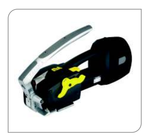
Zapak ZP 26

The high strap tension of these portable plastic strapping tools permits the processing of plastic straps up to a width of 19 mm and a thickness of 1.35 mm. The heavy polyester straps permit the problem-free replacement of the traditional steel straps and result in considerable savings.