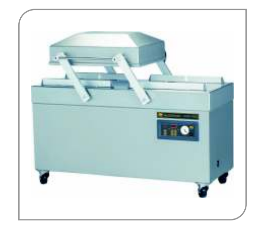
Double Chamber Vacuum Packaging Machines