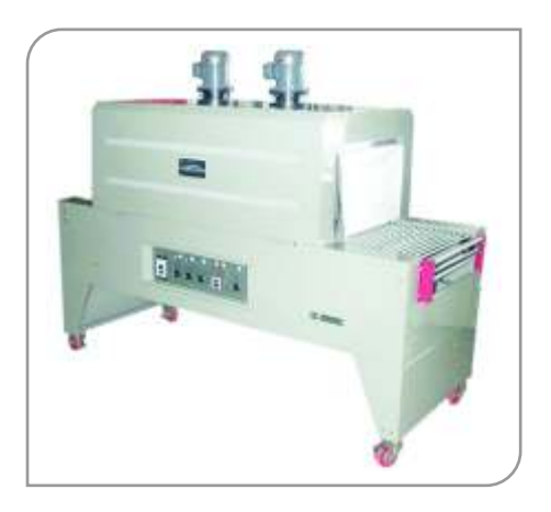
Heavy Duty Shrink Tunnel