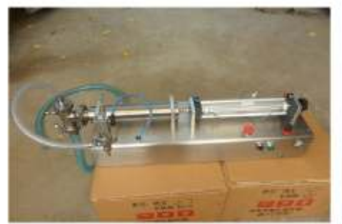
Liquid Filling Machine Single Head