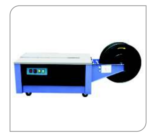
Floor Model Semi Automatic Strapping Machines