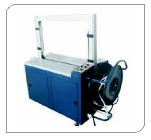
Automatic Strapping Machines

VG Packs strapping machines, ranging from affordable semi automatic units, to fully automatic high tech, ease of use machines. Our strapping machines will suit 6-16mm strap, as well as having many features to suit your warehousing requirements.