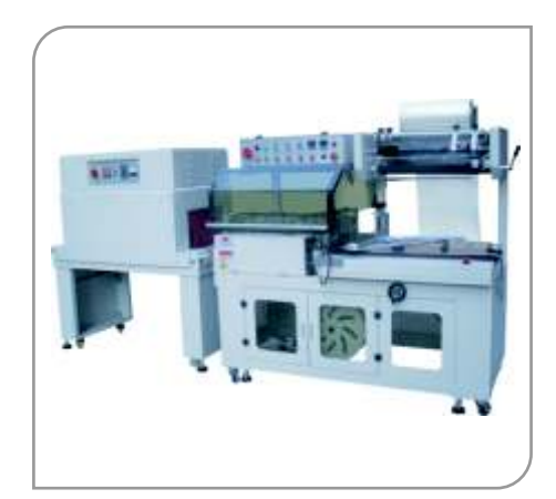
Fully Auto Shrink Wrapping System