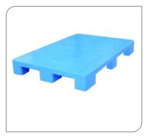
Roto Molded Plastic Pallets