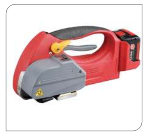
H 45 L