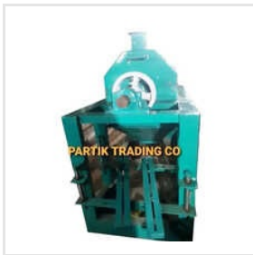
440 V Emery Roller