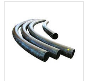
Mild Steel Bend Pipe