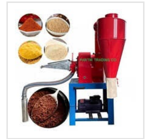
Industrial Chilli Grinding Machine