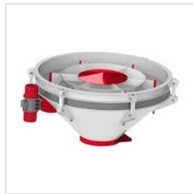
Automatic Vibro Storage Tank