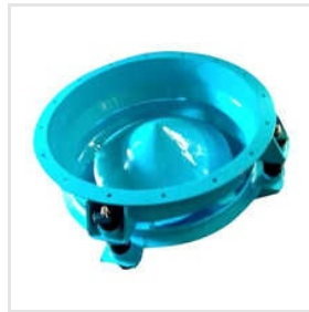
2 Ton Vibro Beans