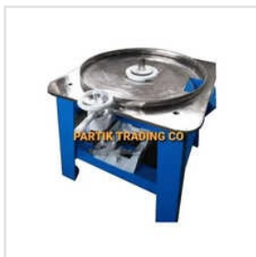
440 V Atta Chakki Machine