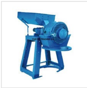
Double Stage Pulverizer