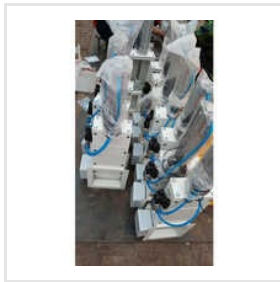
Sluice Gate Flour Mill Machine