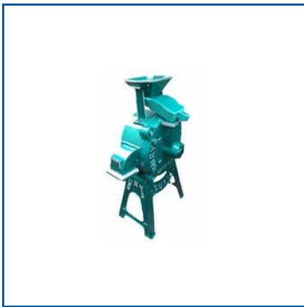
16 INCH MILL WHEAT ATTA CHAKKI MACHINE