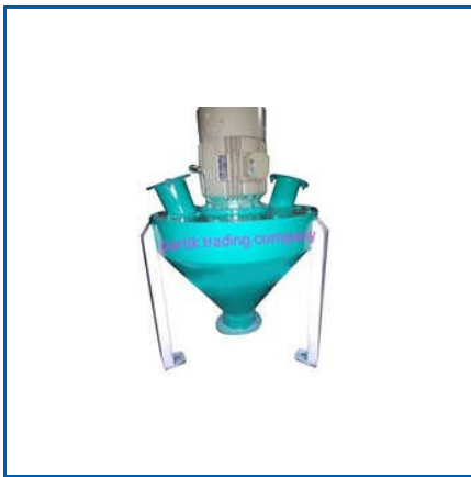
ENTOLETER FLOUR MILL MACHINE

14 Inch Besan Plant Impact Pulverizer, 16 Inch Mill Wheat Atta Chakki Machine, 2 Inch Mild Steel Bend, 2 Ton Vibro Beans, 240 V Plan Sifter Bag, 4 Feet SS304 Stainless Steel Pipe, 4-5 Ton Bucket Elevator, 440 V Atta Chakki Machine, 440 V Emery Roller, 440 V Flour Sifter Machine, 440 V High Pressure Centrifugal Blower, 440 V Rice Destoner Machine, 440V Centrifugal Machine, 5 TPH Rice Cleaning Machine, 90mm Rubber Anti Vibration Mount, etc.