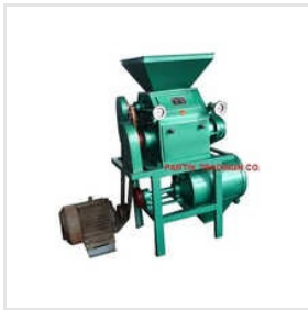
Flour Machine Roller Machine