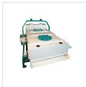
Vibro Classifier Machine