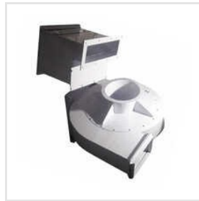
440 V High Pressure Centrifugal Blower