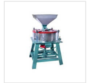
Wheat Grinding Machine