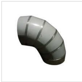
2 Inch Mild Steel Bend