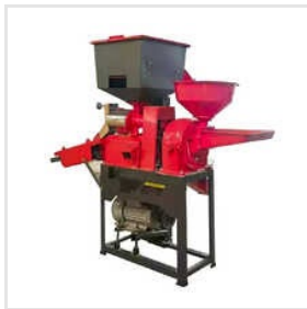
Commercial Spice Grinder Machine