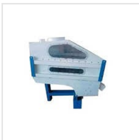
440 V Rice Destoner Machine