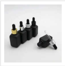
30ml Black Matt Dropper Bottle