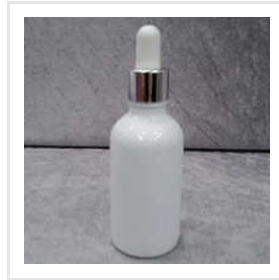
50ml White Cotted Glass Dropper Bottle