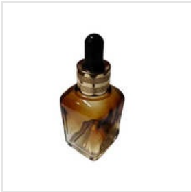
Polyester Dropper Bottle