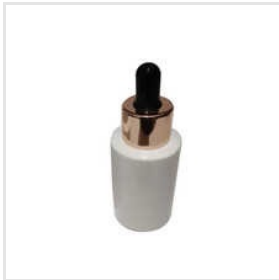
Epoxy Polyester Dropper Bottle