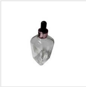
Clear Square Glass Bottle