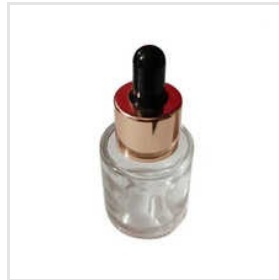
Medicine Glass Dropper Bottle