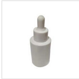
Epoxy Polyester Semi Dropper Bottle