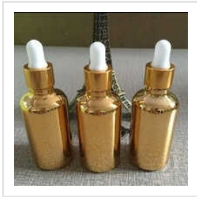
30ml Golden Dropper Bottle