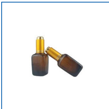
18CM AMBER RECTANGLE GLASS DROPPER BOTTLE