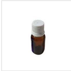
10ml Glass Dropper Bottle