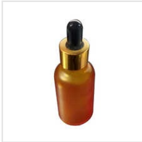
30ml Glass Dropper Bottle