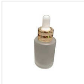
Cosmetic Glass Dropper Bottle