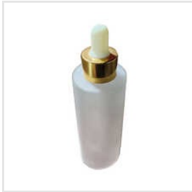
100ml Clear Glass Dropper Bottle