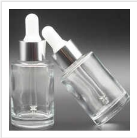
LGB Clear Glass Bottle