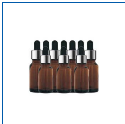
30ML AMBER DROPPER BOTTLE