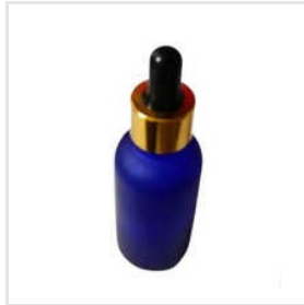
Blue Glass Dropper Bottle