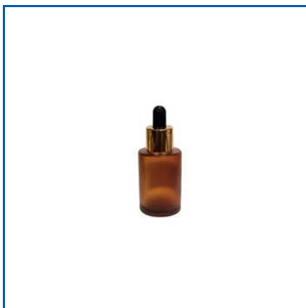
30ML LGB AMBER FROSTED DROPPER BOTTLE

100gm Amber Frosted Jar, 100gm Amber Glass Jar, 100ml Clear Glass Dropper Bottle, 10ml Glass Dropper Bottle, 10ml Glass Roll On Bottle, 10ml Matt Black Glass Roll On Bottles, 10ml Plastic Dropper, 10ml Roll On Bottles, 14.4cm Lotion Pump Glass Bottle, 15ml Amber Lotion Pump Bottle, 15ml Ear Dropper Bottle, 15ml Green Glass Dropper Bottle, 15ml Green Lotion Pump Bottle, 18cm Amber Rectangle Glass Dropper Bottle, 18mm Plastic Lotion Pump, etc.