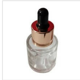
Transparent Glass Dropper Bottle