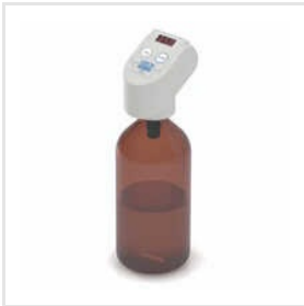
Bod Sensor Set