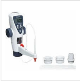
Burette Digital Titrette