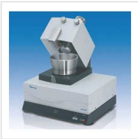
RM 200 Mill