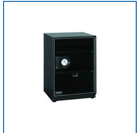
AUTOMATIC DESICCATOR CABINET