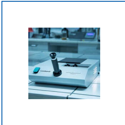
MODEL F DIGITAL COLORIMETER