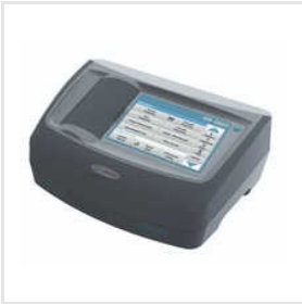
Dr 3900 Spectrophotometer