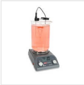
Remi Magnetic Stirrer With Hot Plate