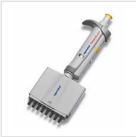
8 Channel Pipettor