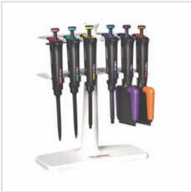
Pipette Stand F-Stand 6 Places