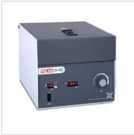
Remi Laboratory Centrifuge