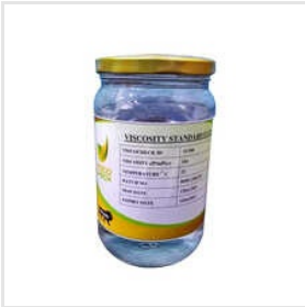
Viscocheck Viscosity Standard Oil