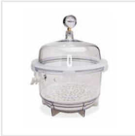
LLG-Automatic Desiccator Round