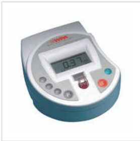
CO8000 Cell Density Meter