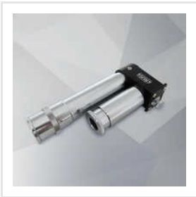
HS1504 Hand Spectroscope