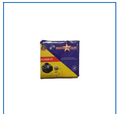
AUTO PARTS CYLINDER KIT