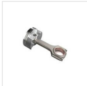
Bike Engine Piston