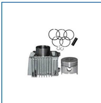
ROCKSTAR CYLINDER KIT