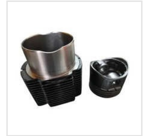
Cast Iron Bike Piston