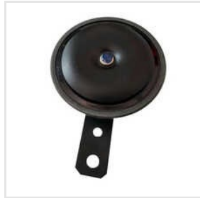
Mitutoyo Smart Neo Bike Horn