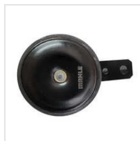
Mahale 12V Bike Horn