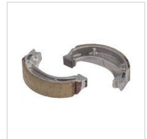
Aluminium Bike Brake Shoe