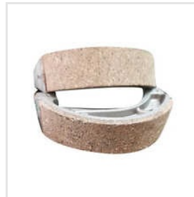
Bike Brake Shoe