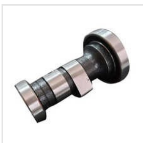
Stainless Steel Bike Camshaft