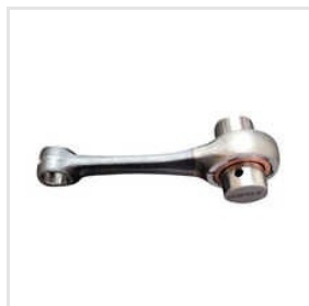
Automobile Connecting Rod