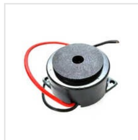
Toyomite Bike Buzzer