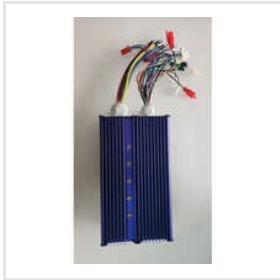
E Rickshaw Controller