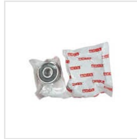
Bike Wheel Ball Bearing