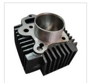
Two Wheeler Cylinder Kit