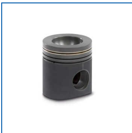
CONTENT CYLINDER BLACK KIT

Aluminium Bike Brake Shoe, Ape Three Wheeler Valves, Auto Parts Cylinder Kit, Automobile Connecting Rod, Bike Brake Shoe, Bike Clutch Plate, Bike Engine Piston, Bike Horn, Bike Wheel Ball Bearing, Cast Iron Bike Piston, Content Cylinder Black Kit, E Rickshaw Controller, Front Wheel Lock, Half Gasket Set, Mahale 12V Bike Horn, etc.