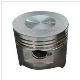
Stainless Steel Bike Piston