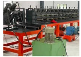
Gypsum False Ceiling POP Roll Forming