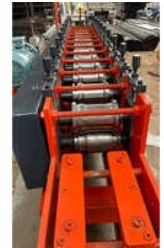
Rolling Shutter Roll Profile Forming