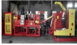
Three Phase Coil Cut To Length Machine