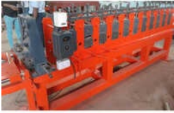
Metal Door Frame Roll Forming Machine