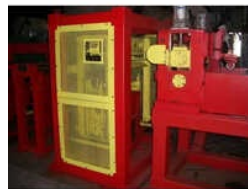
Rotary Shear Cut To Length Machine