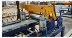
Fully Automatic Roll Forming Machine