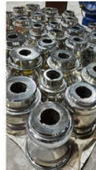
Roll Forming Ring Bending Roller Set