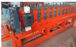
METAL DOOR FRAME ROLL FORMING FULLY AUTOMATIC ROLL FORMING MACHINE

3 Phase Ring Bending Machine, Automatic Hydraulic Shearing Machine, C To Z Purlin Roll Forming Machine, Coil Processing Line Decoiler Machine, Fully Automatic Roll Forming Machine, Gypsum False Ceiling POP Roll Forming Machine, Industrial Cut To Length Line Machine, Industrial Hydraulic Decoiler Machine, Industrial Ring Bending Machine, Metal Door Frame Roll Forming Machine, Roll Forming Ring Bending Roller Set, Rolling Shutter Roll Profile Forming Machine, Roofing Sheet Profile Roll Forming Machine, Rotary Shear Cut to Length Machine, Semi-Automatic Steel Coil Slitting Line Machine, etc.