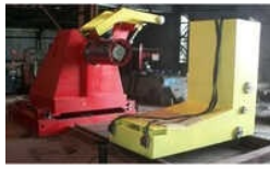
Industrial Hydraulic Decoiler Machine