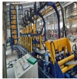
C To Z Purlin Roll Forming Machine