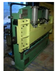
Automatic Hydraulic Shearing Machine