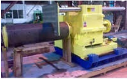
Coil Processing Line Decoiler Machine