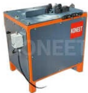
3 Phase Ring Bending Machine