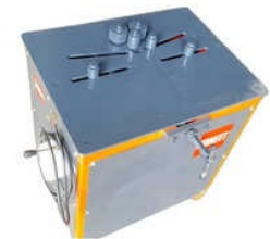
Industrial Ring Bending Machine