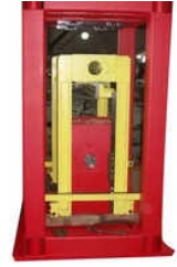
Industrial Cut To Length Line Machine