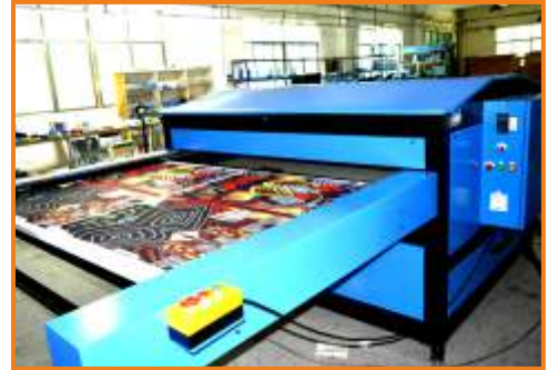
Heat Press Sublimation Machine