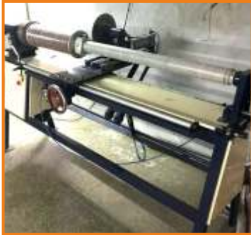
Roll Cutting Machine

Used on windows, doors, screens, shutters, louvres and even outdoor furniture, fan, industries, home appliances etc.