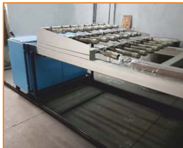
WOOD GRAIN SUBLIMATION MACHINE (for Aluminum section and steel doors etc)

Metal is given the wood finish through Sublimation Process. The sublimation process can apply almost any pattern onto a base coat of powder coating, transforming the appearance of the object.