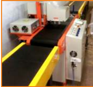
Bagging/ Ultra Sonic Sealing Machine