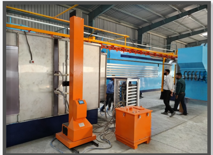
RECIPROCATOR WITH AUTOGUNS