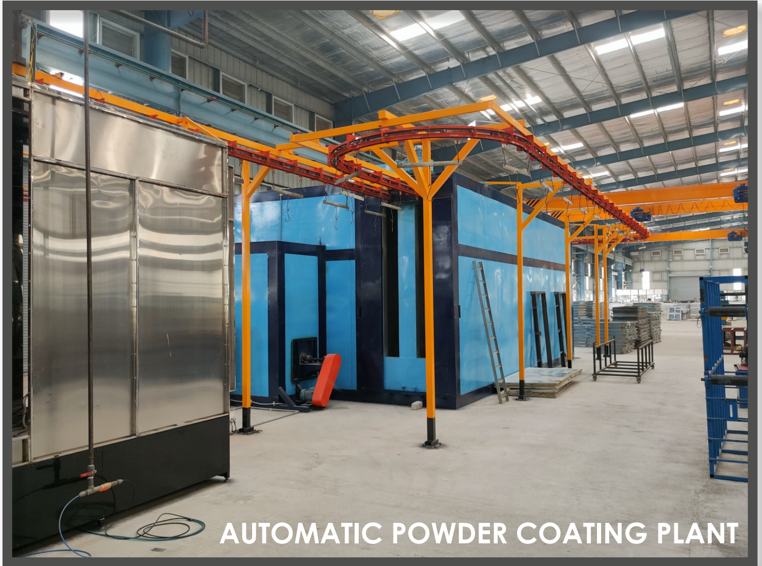
AUTOMATIC POWDER COATING PLANT

Semi Automatic powder coating booth with the Multi-cyclone recovery system. Bag filter & cartridge filter options available. Powder curing ovens with electrical, oil fired & gas fired heating options are available. Conveyor track and trolley (manual) for material handling as an option