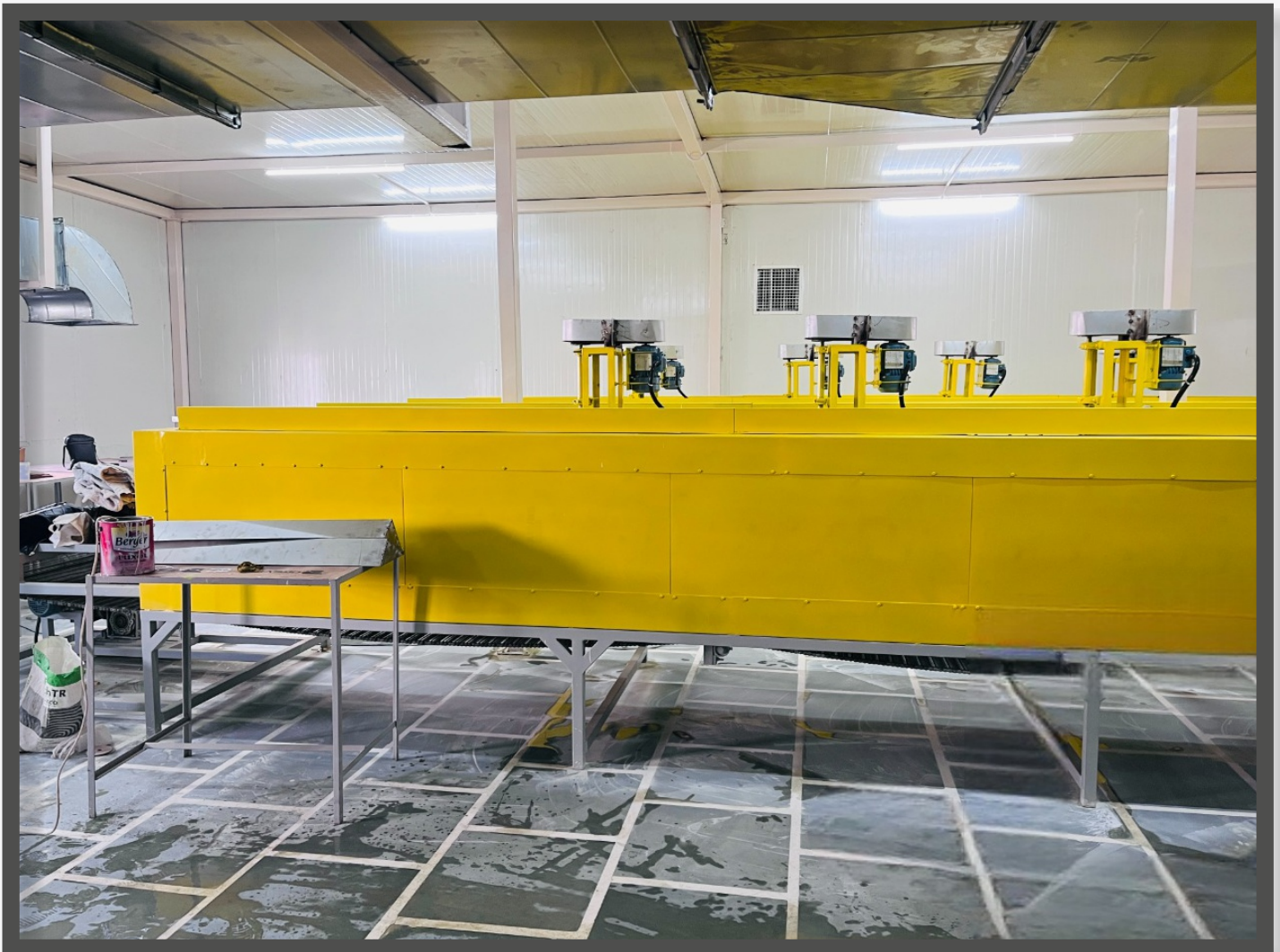
INDUSTRIAL BELT CONVEYOR OVEN