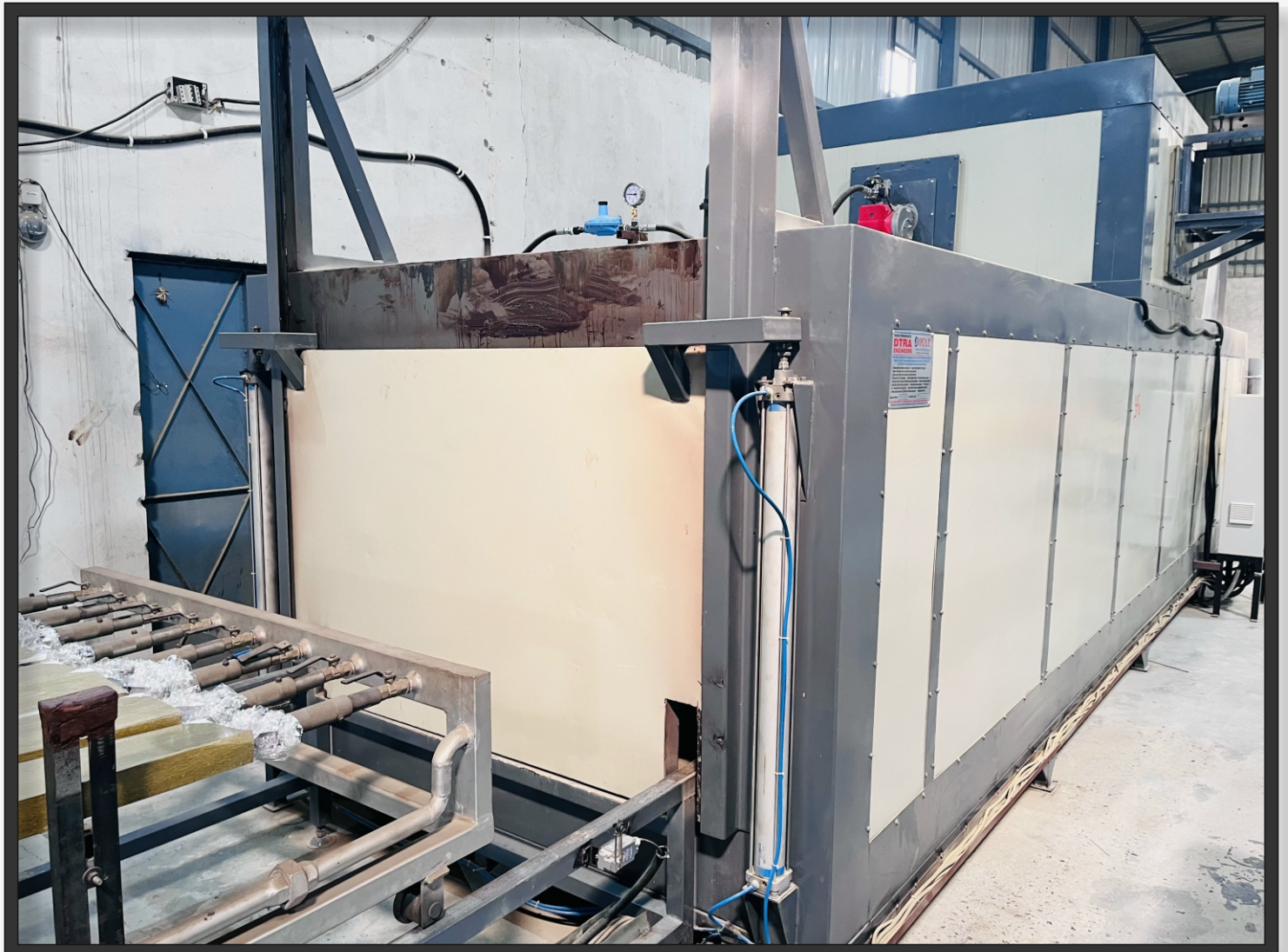
WOOD SUBLIMATION PLANT