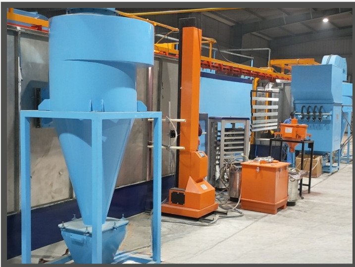
SS 304 - POWDER COATING BOOTH