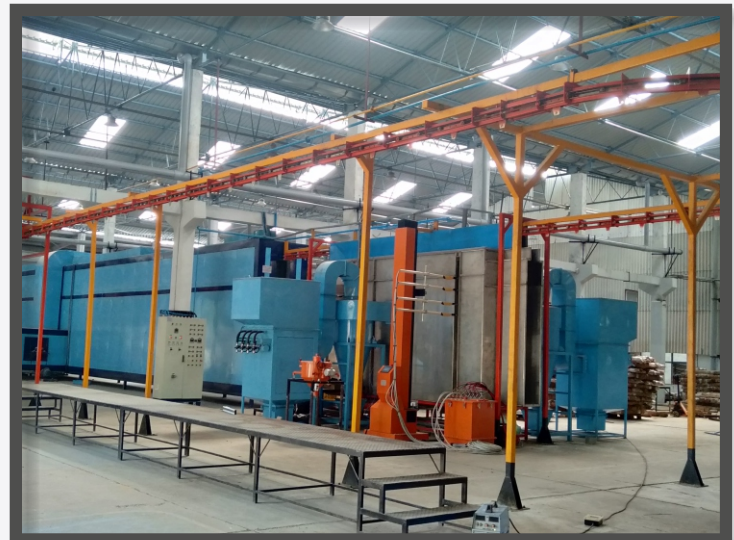
SS 304 - POWDER COATING BOOTH