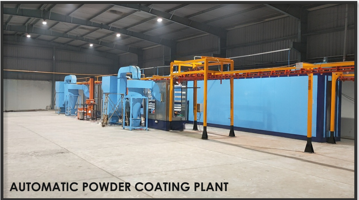
AUTOMATIC POWDER COATING PLANT

Industrial Conveyerised Powder Coating Plant is a highly efficient and automated system used for applying powder coatings onto various objects or components in industrial settings. The enclosed insulated chamber is provided with air circulating blowers & heating system. The air is circulated in the chamber to increase & distribute even temperature in all over area. Solvent evaporation exhaust system is provided to maintain solvent LEL level.