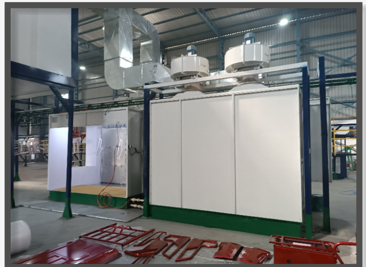
LIQUID PAINTING BOOTH