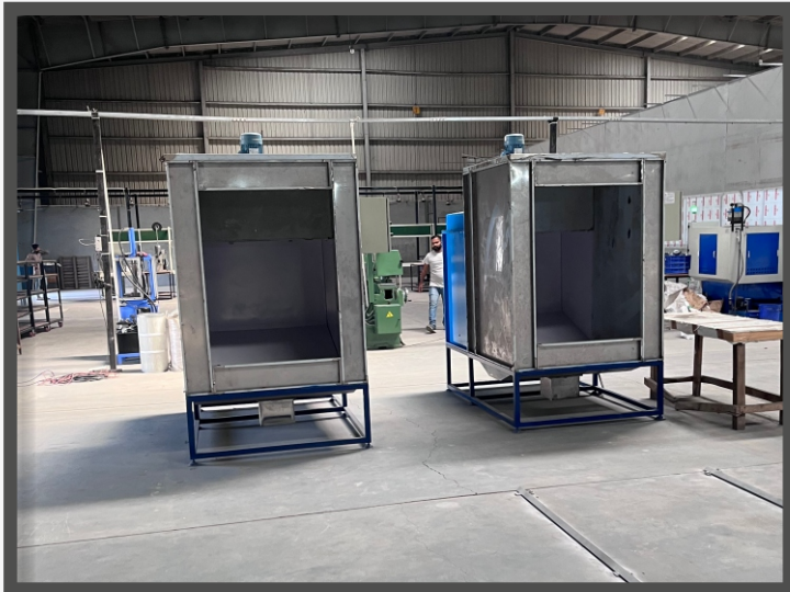
POWDER COATING BOOTH