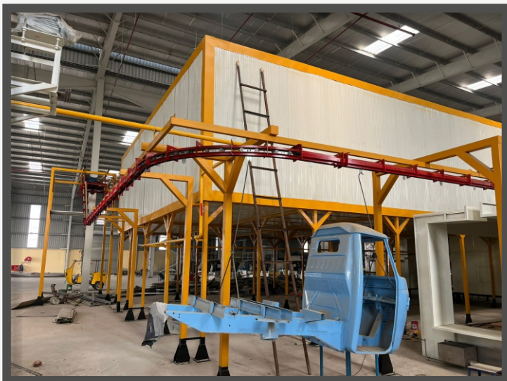
CAMEL BACK CURING OVEN