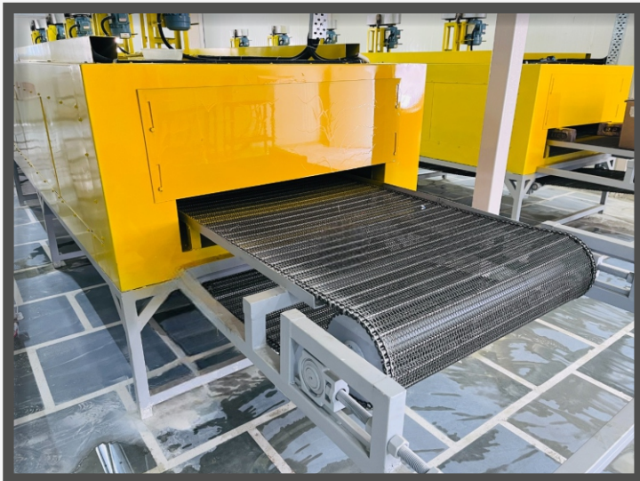
INDUSTRIAL BELT CONVEYOR OVEN