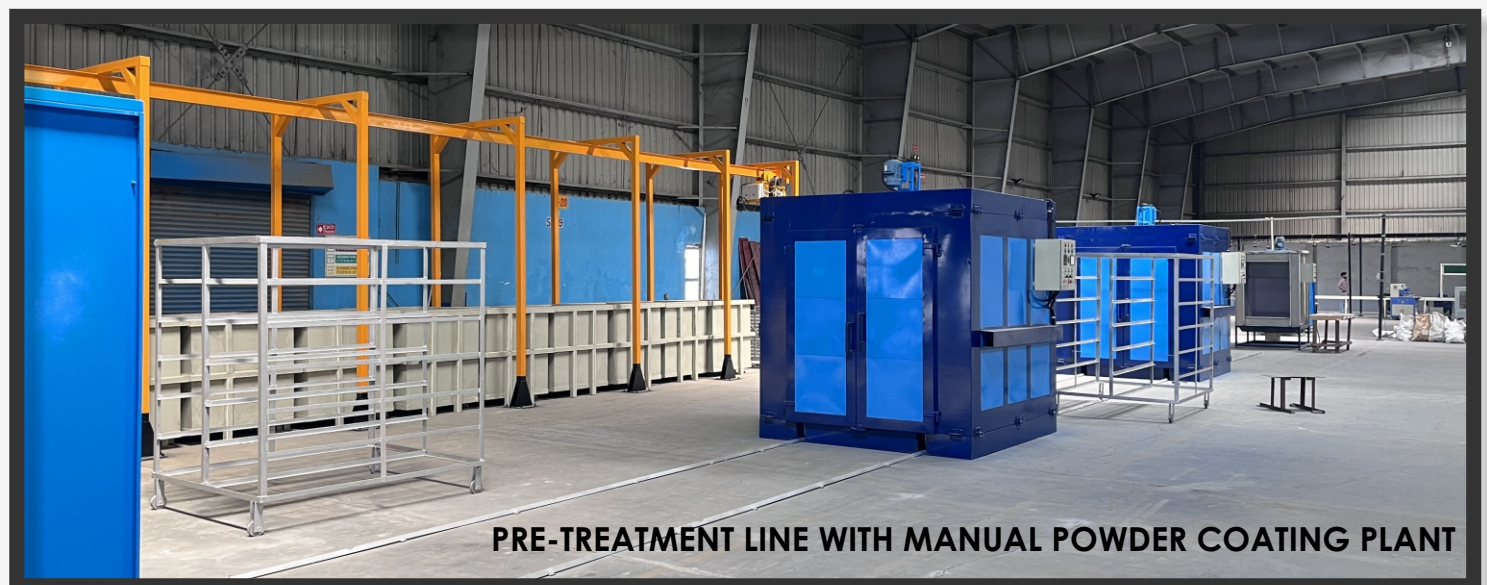
PRE-TREATMENT LINE WITH MANUAL POWDER COATING PLANT