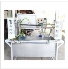
Special Purpose Machine