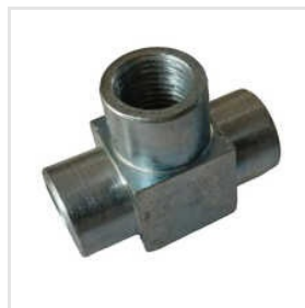
Mild Steel Hydraulic Tee