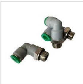
Pneumatic Elbow Connector