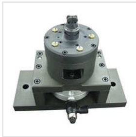
Pneumatic Clamping Fixture