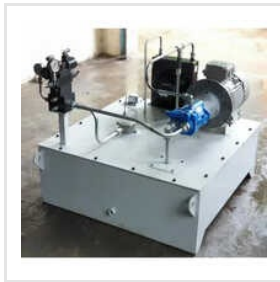
Filter Cleaning System