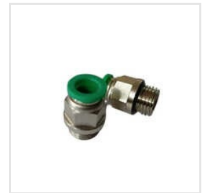
1-4x8 MM Push In Fittings Male