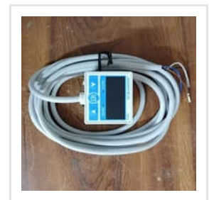
Janatics PS0101504 Digital Pressure Sensor