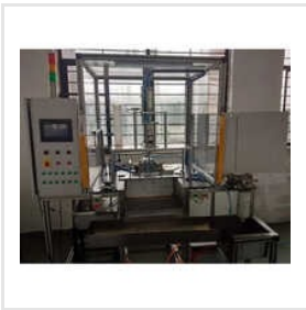
Leak Testing Machine