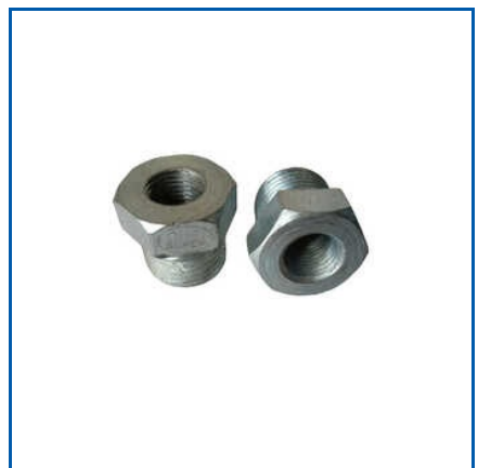
1-2 INCH MALE FEMALE ADAPTER