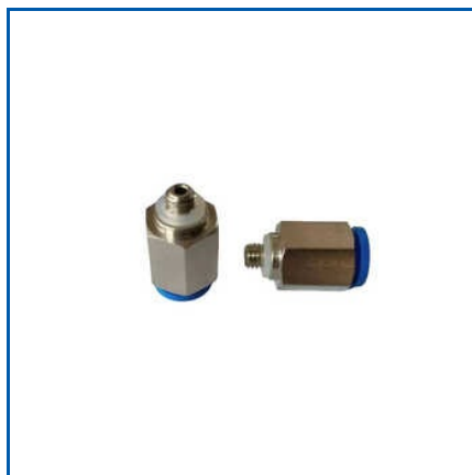
PU MALE PNEUMATIC CONNECTOR