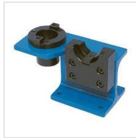
Mild Steel Clamping Fixture