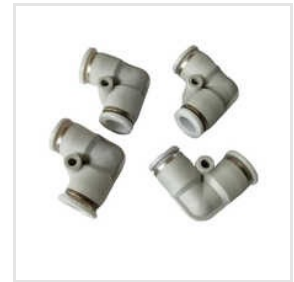
Pneumatic Elbow Connector