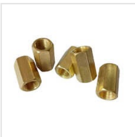
M10 Golden Hexagonal Brass Hex Nut