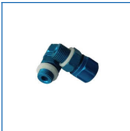
ALUMINIUM ZERO LEAK CONNECTOR

1-2 Inch Dowty Seal, 1-2 Inch Male Female Adapter, 1-4 inch Pneumatic Flow Control Valve, 1-4x8 MM Push In Fittings Male, 4 MM Straight Connector Quick Fit Tube Couplings, 8 MM PU Pneumatic Equal Tee, Aluminium Zero Leak Connector, Assembly Fixture And Jigs, Automatic Air Brake System, Automatic SPM Machine, Automatic Testing Units, CNC Lathe Inserts, Cleaning Fixture With Water Pressure, Concentricity Checking Fixture, Conveyor System With Printer And Weight Checking, etc.