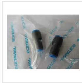
4 MM Straight Connector Quick Fit