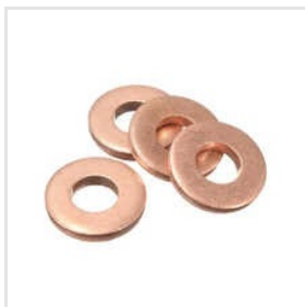
M16 Round Copper Washer