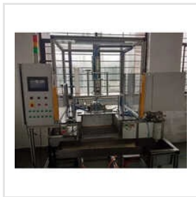
Automatic SPM Machine