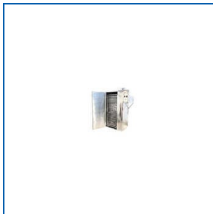
96 AIR TRAY DRYER