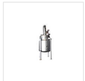
CGMP Reactor Machine