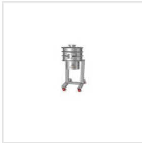
SS Vibro Sifter