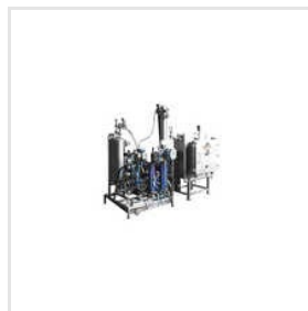
Isolation Model Vacuum Tray Dryer