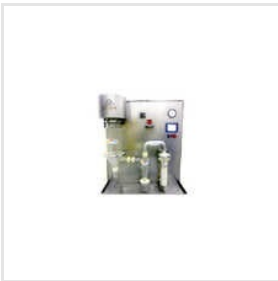
500L Fully Automatic Spray Dryer