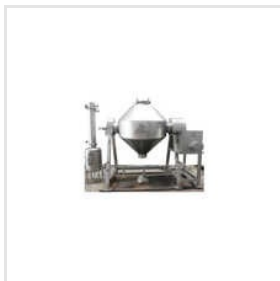
Rotary Vacuum Dryer