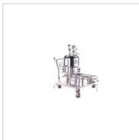
SS Liquid Filling Machine