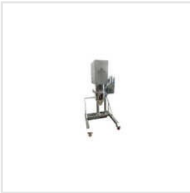
SS Direct Driven Multi Mill