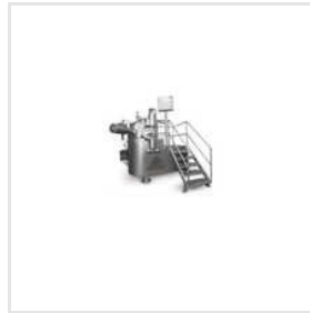
SS Rapid Mixer Granulator Machine