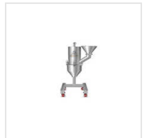
SS Multi Mill