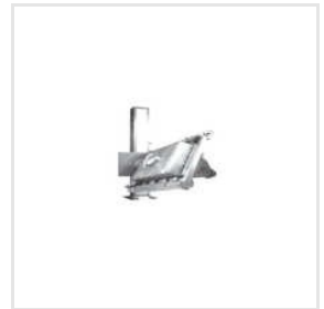
SS Conta Bin Blender