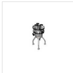
Antistatic ETFE Coated Nutsche Filter