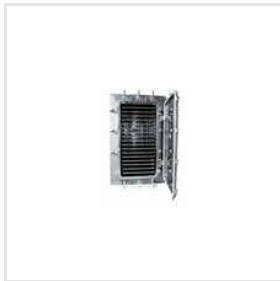
96 Vacuum Tray Dryer