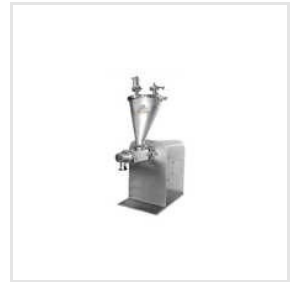
SS Twin Screw Feeder