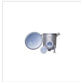
ETFE Lined Vessel