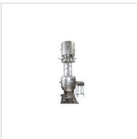
500l Planetary Mixer Machine