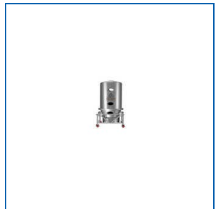
SS FLUID BED DRYER