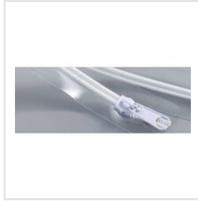
PVC Zipper Roll