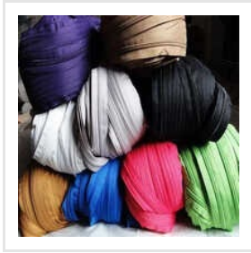
Bag Zipper Roll