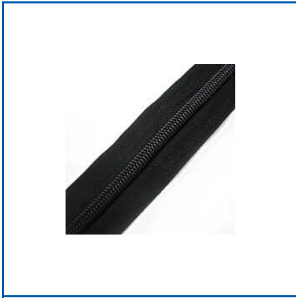
NYLON ZIPPER ROLL

Bag Zipper Roll, Colored CFC Zipper Roll, Nylon Zipper Roll, PVC Zipper Roll, etc.