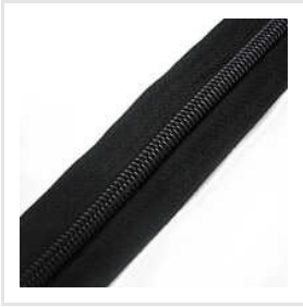
Nylon Zipper Roll