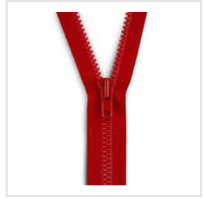
Colored CFC Zipper Roll