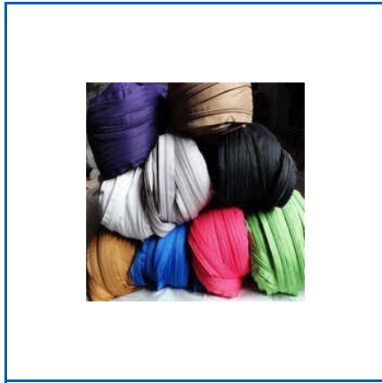
BAG ZIPPER ROLL