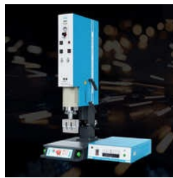
L3000 STANDARD ULTRASONIC PLASTIC WELDING MACHINE