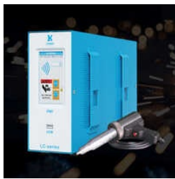
HAND HELD ULTRASONIC PLASTIC WELDING MACHINE

1500W Ultrasonic Converter Booster, 2000W Hot Plate Welding Machine, 3200W Ultrasonic Converter Booster, 380V AC Hot Plate Welding Machine, 4200W Ultrasonic Converter Booster, Hand Held Ultrasonic Plastic Welding Machine, L3000 ES Model Ultrasonic Plastic Welding Machine, etc.