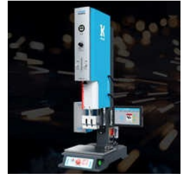
L3000 Plus Digital Model Ultrasonic