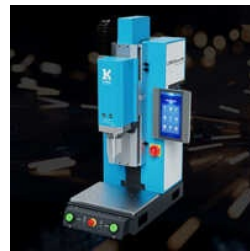
L3000 SERVO MN Ultrasonic Plastic