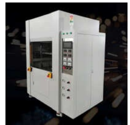
2000W Hot Plate Welding Machine