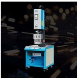
L4000 Standard Analog Standard