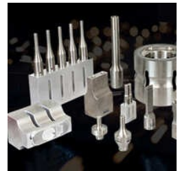
Ultrasonic Horn And Fixtures