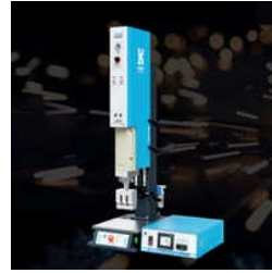
L3000 ES Model Ultrasonic Plastic