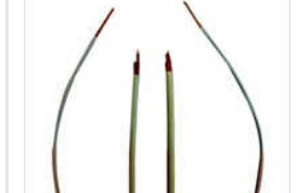
Insulated Winding Wire