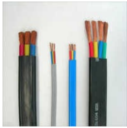
Submersible Pump Cable