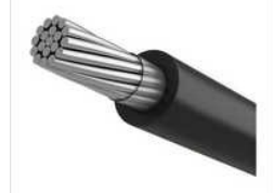
PE Insulated Wire