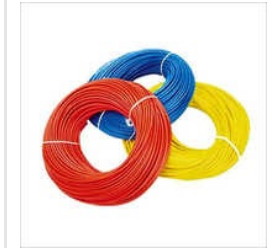
PVC Insulated Flexible Wire