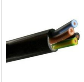
Insulated Flexible Multicore Submersible