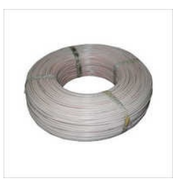
PVC Insulated Winding Wire