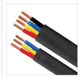
Electronic Submersible Cable