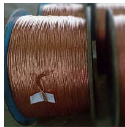
MULTISTRAND COPPER CONDUCTOR