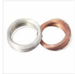
PTFE Insulated Wires