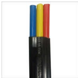
FLAT SUBMERSIBLE PUMP CABLE

Armoured and Unarmoured Control Cable, Bluflex Dewatering Cables, Double Sheathed Flexible Cable, Electrical Insulated Wires, Electronic Submersible Cable, Electronic Three Core Cables, Electronic Unarmoured Control Cable, Flame Retardant Cable, Flat Flex Multi core Cable, Flat Submersible Pump Cable, Flexible Multi Core Cable, Flexible Wire, Higher Temperature Application Cables, Insulated Cables, Insulated Flexible Multicore Submersible Cable, etc.