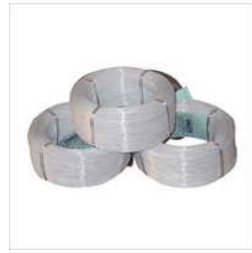
Poly Insulated Winding Wire