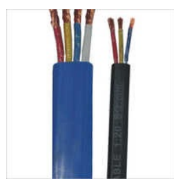
Poly Insulated Submersible Cable