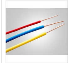
Electrical Insulated Wires