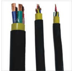
Bluflex Dewatering Cables