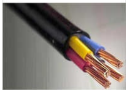
PVC Insulated Cables