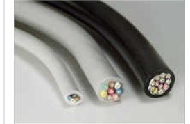
PVC Power Cables