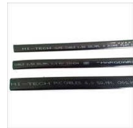
FLAT SUBMERSIBLE PUMP CABLE