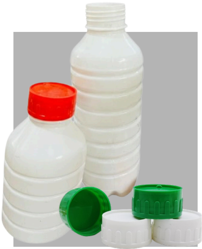
46 MM PESTICIDE CAP