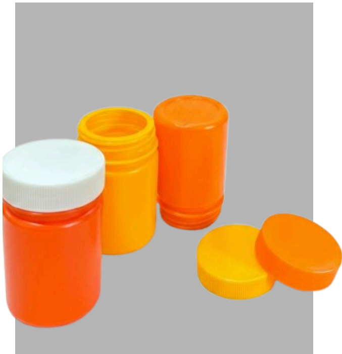
TABLET CONTAINER WITH CAP