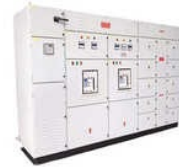
Power Control Centre Panels