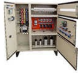
Automatic Power Factor Control Panel