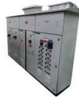
Generator Electrical Control Panel