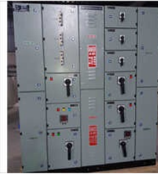
14 Power Distribution Board