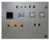
Industrial Control Panel