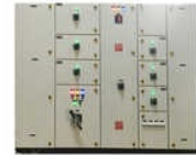
Power Distribution Panel Board