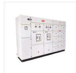
PLC CONTROL PANEL