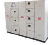
Main Distribution Board MDB Panel