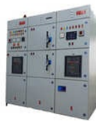
Auto Main Failure Panel