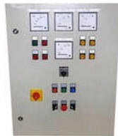
Generator Control Panel