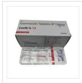
12 MG Covilife Tablets