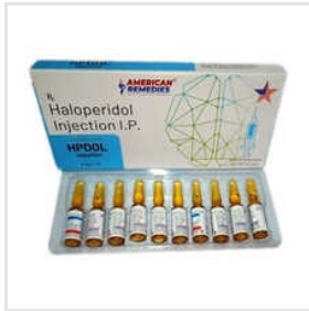
5 Mg Haloperidol Injection