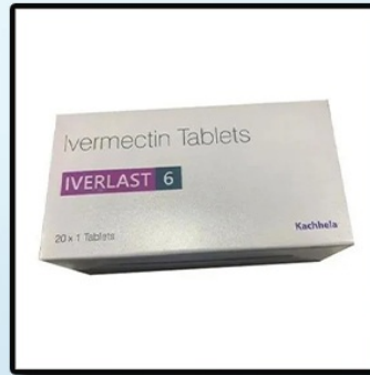
IVERLAST 6 MG TABLETS