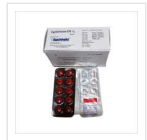
ER 15 MG Cycloboon Tablet