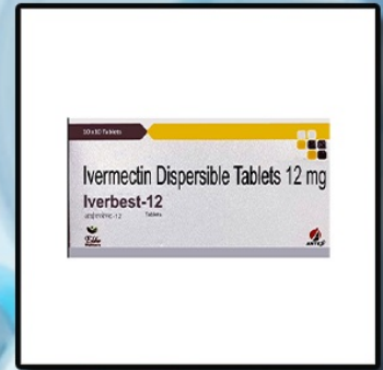
IVERBEST 12 MG TABLETS

0.4mg Tamsulosin Capsules, 0.5mg Colchicine Tablets, 1 MG Finasteride Tablets, 1 mg Injek Injection, 10 MG Glycidap Tablet, 100 Artemisinin Capsules, 100 MG Artesunate Tablets, 100 mL Ivonex Injection, 100 mg Tablets, 100 mg Doxicip Capsule, 100 mg Minocycline Tablets, 100 mg Nitrofurantoin Capsules, 100 ml Tribivet Injection, 1000 mg Vanking Injection, 100mcg Fludrocortisone Tablets, etc.