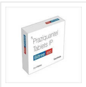
600 MG Biltree Tablets