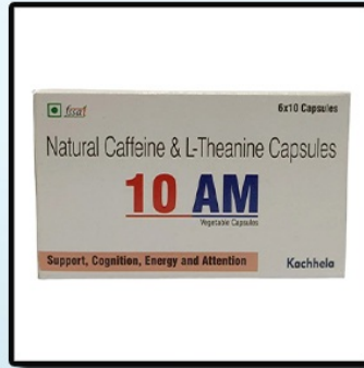
10 AM VEGETABLE CAPSULES