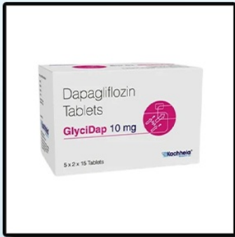
GLYCIDAP 10 MG TAB