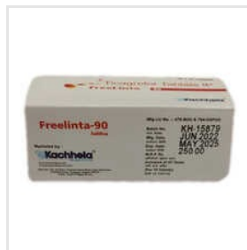
90mg Ticagrelor Tablet