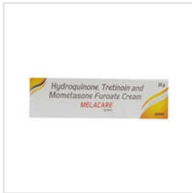
20 G Melacare Cream