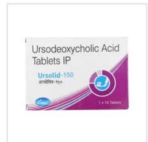
150 Mg Ursodeoxycholic Acid