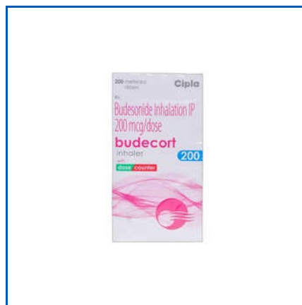
200 MG BUDECORT INHALER