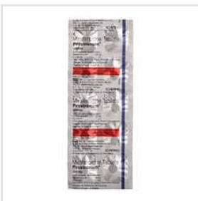
25mg Provironum Tablets