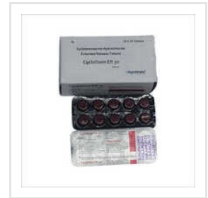
ER 30 MG Cycloboon Tablet