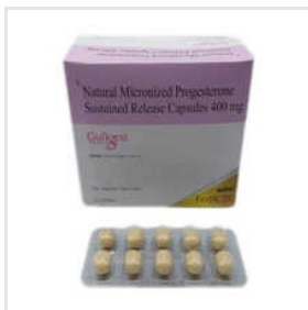
400 Mg Natural Micronised