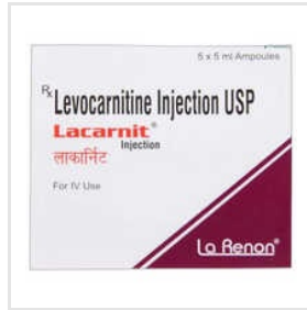
5ml Lacarnit Injection