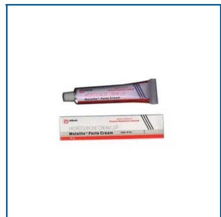
MELALITE FORTE CREAM