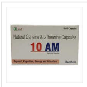
Natural Caffeine And LTheanine Capsules