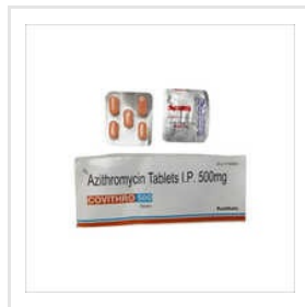
500 MG Covithro Tablet