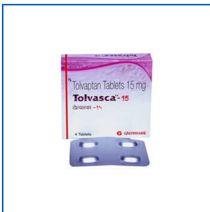
15MG TOLVAPTAN TABLET

0.4mg Tamsulosin Capsules, 0.5mg Colchicine Tablets, 1 MG Finasteride Tablets, 1 mg Injek Injection, 10 MG Glycidap Tablet, 100 Artemisinin Capsules, 100 MG Artesunate Tablets, 100 mL Ivonex Injection, 100 mg Tablets, 100 mg Doxicip Capsule, 100 mg Minocycline Tablets, 100 mg Nitrofurantoin Capsules, 100 ml Tribivet Injection, 1000 mg Vanking Injection, 100mcg Fludrocortisone Tablets, etc.