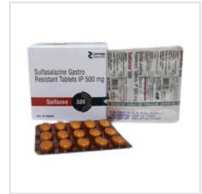
500 Mg Sulfasalazine Gastro Resistant