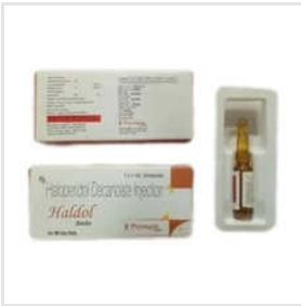
1ml Haldol Injection