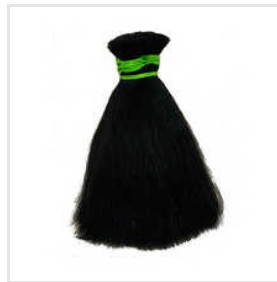
Double Drawn Natural Human Hair