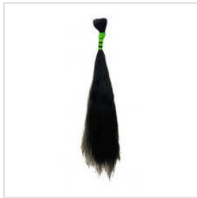
Black Remy Hair