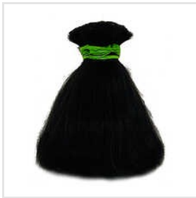
Clip On Human Hair