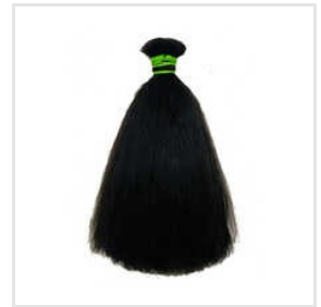
Ladies Human Hair