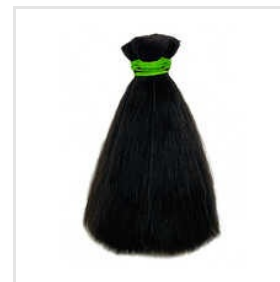
Indian Straight Human Hair