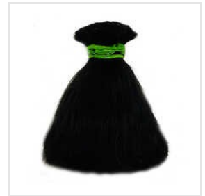
Natural Indian Human Hair