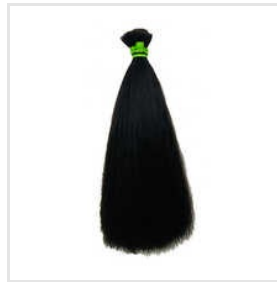
Natural Remy Hair