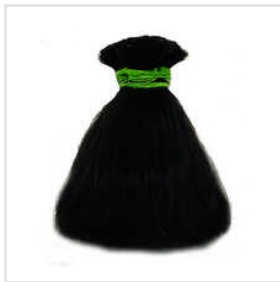
Natural Raw Human Hair