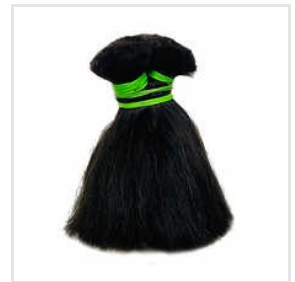
Raw Human Hair