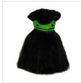
Black Human Hair