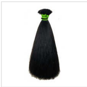
Natural Human Hair