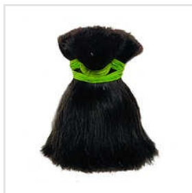
Indian Human Hair