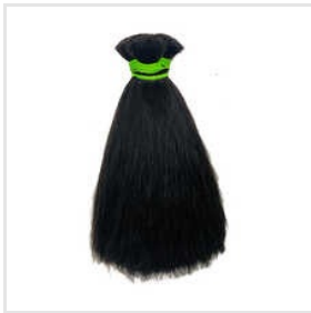
Straight Human Hair