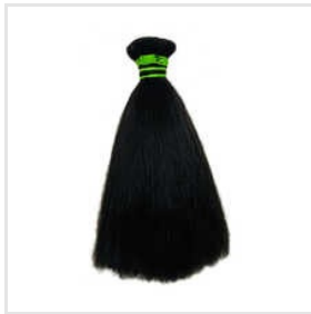
Double Drawn Human Hair