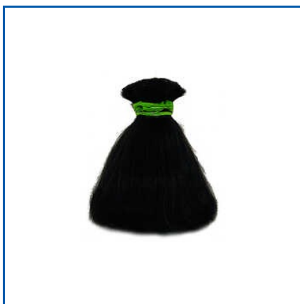
CLIP ON HUMAN HAIR

Black Human Hair, Black Remy Hair, Clip On Human Hair, Double Drawn Human Hair, Double Drawn Natural Human Hair, Indian Human Hair, Indian Straight Human Hair, Ladies Human Hair, Natural Human Hair, Natural Indian Human Hair, Natural Raw Human Hair, Natural Remy Hair, Raw Human Hair, Straight Human Hair, etc.