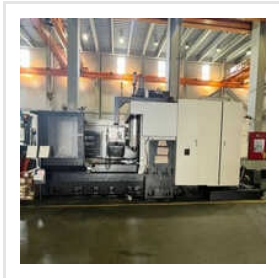
CNC Double Column Machining Centers