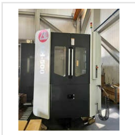
Industrial Horizontal Machining Centers