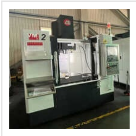
VM2 1200x600 Vertical Machine Center