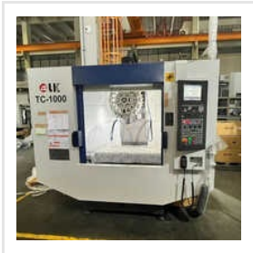
CNC Drilling Tapping Center