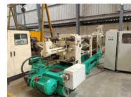
HMT LATHE MACHINE