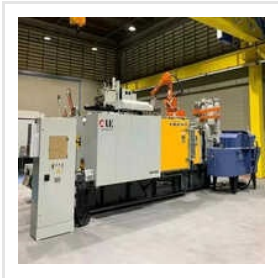
Cold Chamber Die Casting Machine