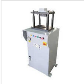
Hydraulic Trimming Presses