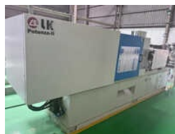
PLASTIC INJECTION MOLDING MACHINE