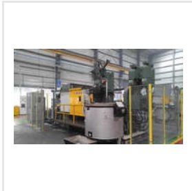
Hot And Cold Chamber Die Casting Machine