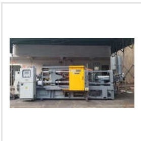
180 Ton Pressure Die Casting Machine