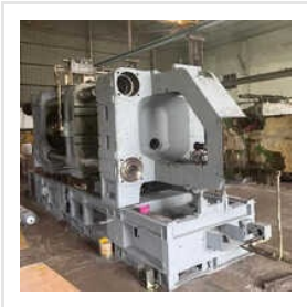
Aluminium Iron Retrofitting Die Casting