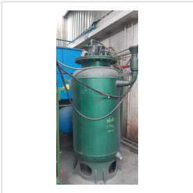
Due Coat Pressure Feed Container