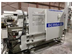
TOSHIBA INJECTION MOLDING MACHINES

180 Ton Pressure Die Casting Machine, 2HP Casting Cooling Conveyor, Aluminium Iron Retrofitting Die Casting Machine, CNC Double Column Machining Centers, CNC Drilling Tapping Center, Cold Chamber Die Casting Machine, Due Coat Pressure Feed Container, HMT Lathe Machine, Hot And Cold Chamber Die Casting Machine, Hydraulic Trimming Presses, Industrial Horizontal Machining Centers, Melbery Copper scrap, Plastic Injection Molding Machine, Toshiba Injection Molding Machines, VM2 1200x600 Vertical Machine Center, etc.