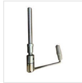
Hospital Bed Handles Screw