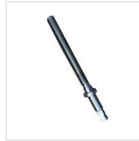
Trapezoid Thread Rod