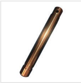
Thread Rolling Screws