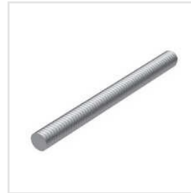
Trapezoidal Lead Screw