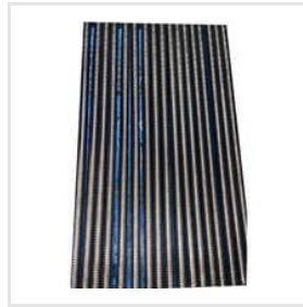
Jacks Screw For Industrial