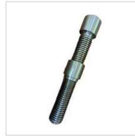
Machine Screw Nuts