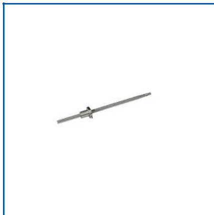
SPINDLE SCREW WITH NUT