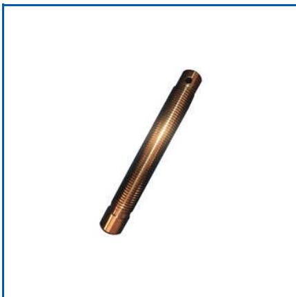
THREAD ROLLING SCREWS

100 Mm Lead Screws, 100mm Stud Carriage, 25 Mm Profile Threading, 3 Start Threading Shaft, 5 TR Mm Lead Screw, 80Mm Spline Rolling, Acme Threaded Screw, Fine Finish Lead Screw With Nut, Gear Box Shaft, Gear Worm Shaft, Heavy Duty Gate Valve Screw, Hospital Bed Handles Screw, Industrial Gate Valve Stem, Industrial Piston Rods, Jacks Screw For Industrial, etc.