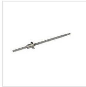
Spindle Screw With Nut