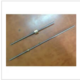
Trapezoidal Lead Screw