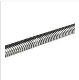
100 Mm Lead Screws