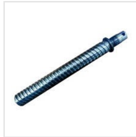
Mild Steel Jack Screws