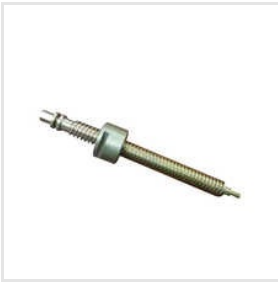
Lead Screws And Nuts