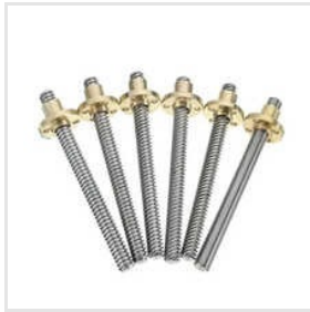
Rolex And Printer Lead Screw