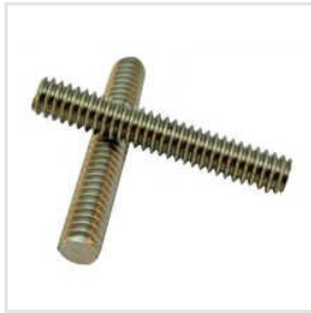
Acme Threaded Screw