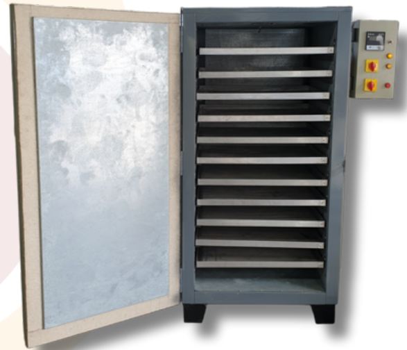
Tray Type Dryer