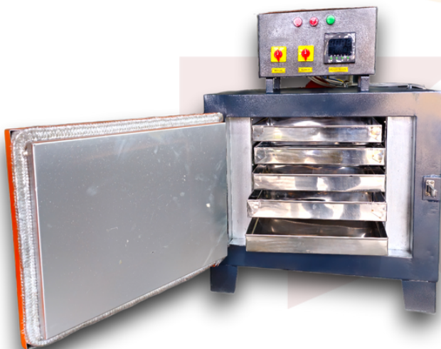
Cabinet Type Food Dryer