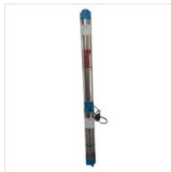
V3 SUBMERSIBLE PUMP