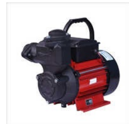
SELF PRIMING SUBMERSIBLE PUMP