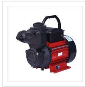
Self Priming Submersible Pump