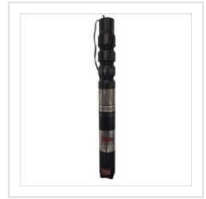
V6 Submersible Pump