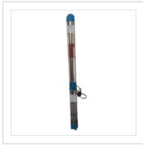
V3 Submersible Pump