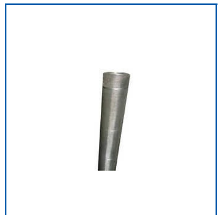
CONSTRUCTION STAINLESS STEEL WIRE MESH