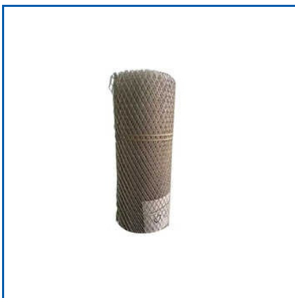
STAINLESS STEEL FENCING WIRE

10 Gauge Galvanized Iron Wire Mesh, 16 Gauge Galvanized Iron Wire Mesh, 304 Stainless Steel Expanded Wire Mesh, 3Ft Mild Steel Wire Mesh, Aluminium Expanded Mesh, Aluminium Expanded Mesh Roll, Aluminium Expanded Wire Mesh, Aluminium Woven Wire Mesh, Aluminum Expand Metal Wire Mesh, Aluminum Fencing Wire Mesh, Aluminum Perforated Sheet, Aluminum Woven Expanded Mesh, Cold Rolled Aluminum Wire Mesh, Construction Stainless Steel Wire Mesh, Galvanised Iron Wire Mesh, etc.