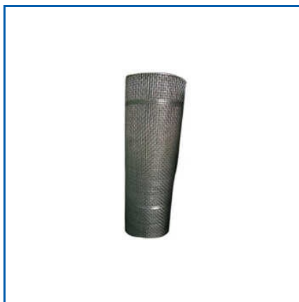
STAINLESS STEEL CRIMPED WIRE MESH