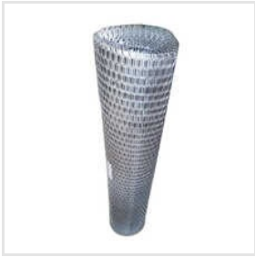
Aluminium Expanded Mesh