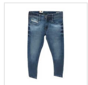
Men Denim Slim Fit Jeans