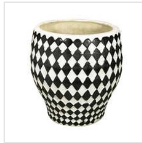
Printed Round Black And White Ceramic