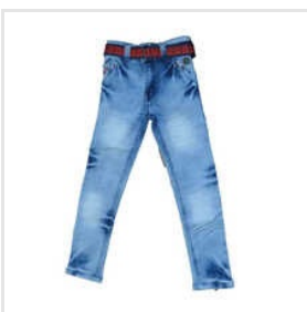
Kids Slim Fit Denim Jeans