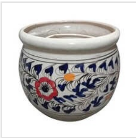
Printed Ceramic Flower Pot