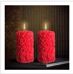
Colored Flame Decorative Candles