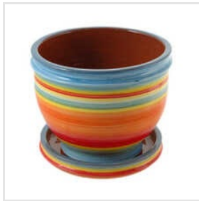
Ceramic Flower Pot For Home