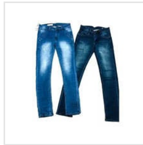
Mens Blue Faded Denim Jeans