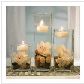
Glass Covering Decorative Candles