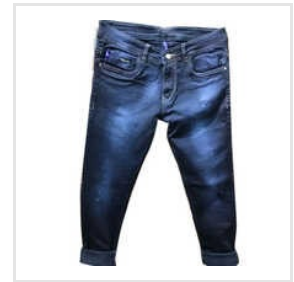
Boy Faded Denim Fashionable Jeans