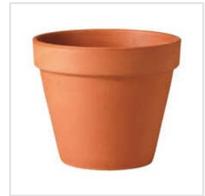
Ceramic Pots For Garden