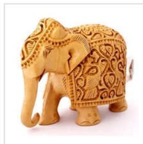
Sal Wooden Elephant Statue