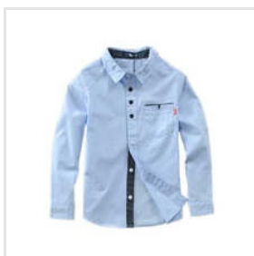
Kids Full Sleeves Plain Cotton Shirts