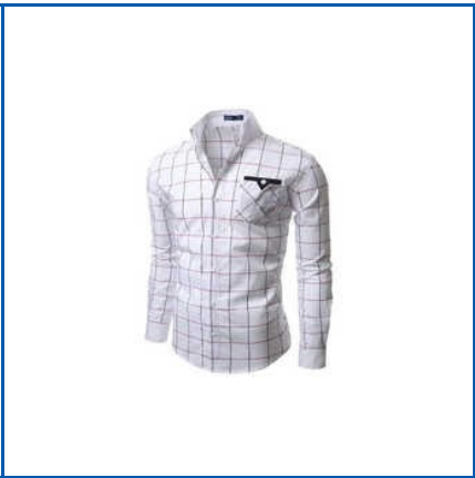
MEN PLAIN WHITE COTTON SHIRT MEN FULL SLEEVES STRIPES SHIRT MEN CASUAL WEAR COTTON SHIRT