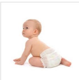
Disposable Cotton White Baby Diaper