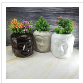
Buddha Ceramic Planter