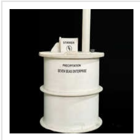
Precipitation Tank With Stirrer