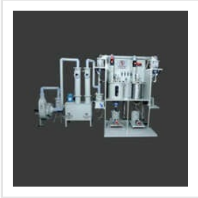
Single Phase Gold Refining Aqua Regia