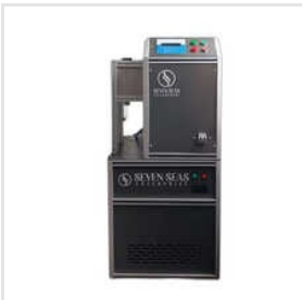
2 KW Gold Melting Induction Furnace