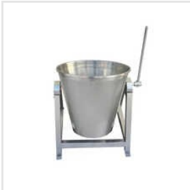
SS Manual Flex Making Machine