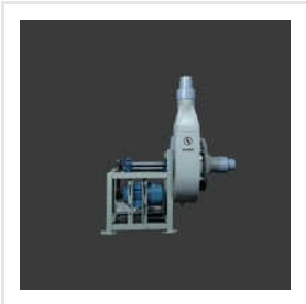
2800 RPM PP Blower For Gold Refining