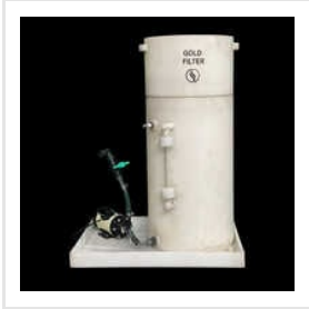
Manual Gold Filter For Gold Refinery