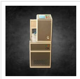
5 Kw Induction Melting Furnace