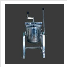
Electric Gold Burning Steel Vessel