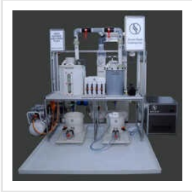
Three Phase Gold Refining Plant