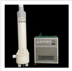
Single Phase Chiller Scrubber Tower