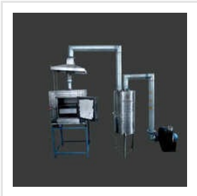
Burnout Furnace With Steel Scrubber