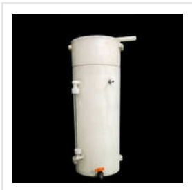
PP Manual Silver Filter For Gold Refinery