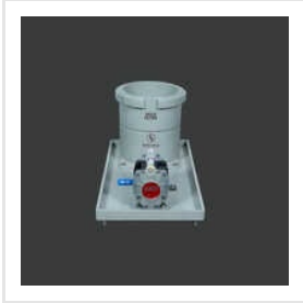
Three Phase Autotype Gold Refining Filter