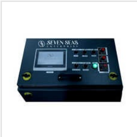
Single Phase HMI Touch Screen Panel