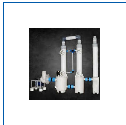
MS SCRUBBER FOR GOLD REFINING PLANT