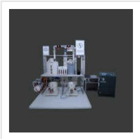
20 KW Gold Refining Machine