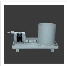
Single Phase Silver Refining Filter