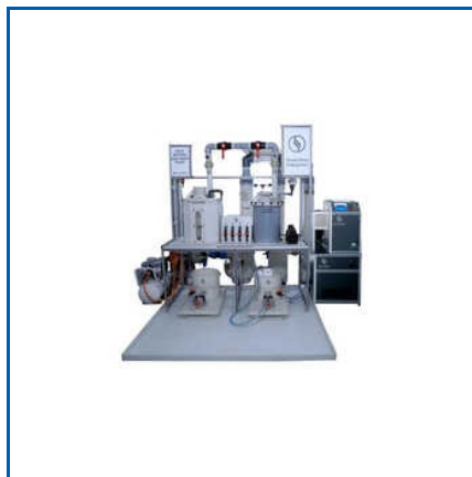
8 KG THREE PHASE GOLD REFINING AQUA REGIA PLANT