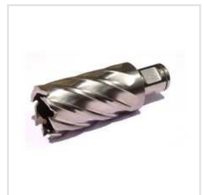
Euroboor Holland HSS Annular Broach Core