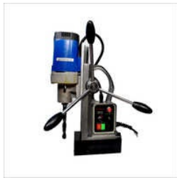
SUPERCUT RJ60S 212 MAGNETIC CORE DRILLING MACHINE

14 Inch Super Cut Off Wheel, Annular Core Cutter, Annular Cutters, B45 Beveling Machine for M.S Plate, Ball Nose Endmill, Bolt Cutter, CVD Milling Cutter, Carbide Flat Tip, Carbide Insert TCGW, etc.