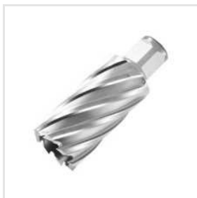
Karnasch HSS And TCT Annular Core Cutter