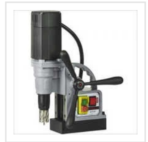
ECO 30 Magnetic Core Broach Cutter Drilling