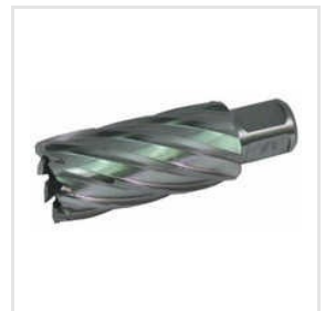
HSS Annular Core Cutter