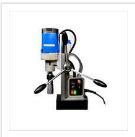
Supercut RJ60S 323 Magnetic Core Drilling