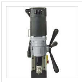
ECO 30 646 Magnetic Core Broach Cutter