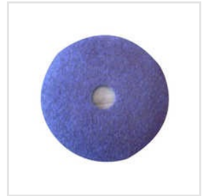
Fiber Sanding Discs