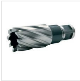
Annular Core Cutter