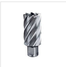
HSS Core Cutter