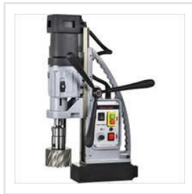
ECO 100-4 Euroboor Magnetic Drilling And