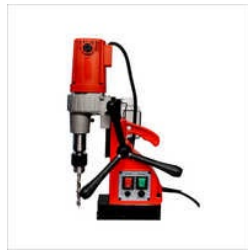
METCUT 35E 121 PORTABLE MAGNETIC BROACHCUTTER CORE DRILLING MACHINE