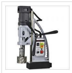
ECO 100-4D Euroboor Holland Gear Portable