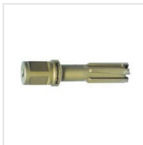
Karnasch Rail Cutter