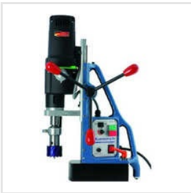
Karnasch Germany Portable Magnetic Drill