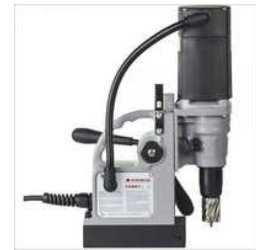
ECO 30 EUROBOOR MAGNETIC DRILLING AND TAPPING MACHINE