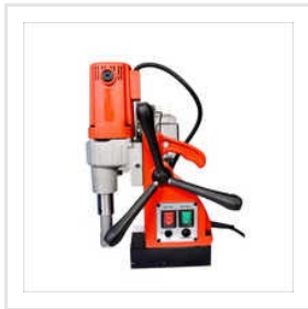
Metcut 35E Magnetic Core Drilling Machine