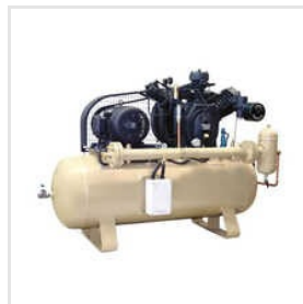
Multistage High Pressure Air