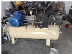
TWO STAGE AIR COMPRESSOR

3HP Cylinder Head Block, AD-100 CFM Refrigeration Air Dryer, AD-150 CFM Refrigeration Air Dryer, AD-20 CFM Refrigeration Air Dryer, AD-40 CFM Refrigeration Air Dryer, AD-60 CFM Refrigeration Air Dryer, AD-80 CFM Refrigeration Air Dryer, Air Receiver Tank, Booster Air Compressor, Cylinder Head Block, High Pressure Air Compressor, Industrial Air Compressor, Industrial High Pressure Air Compressor, Industrial Vacuum Pump, Mini Air Compressor, etc.