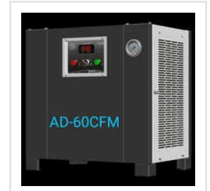
AD-60 CFM Refrigeration Air Dryer