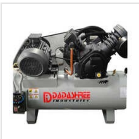
Industrial Air Compressor