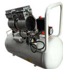
MINI AIR COMPRESSOR