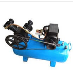
Industrial High Pressure Air