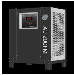
AD-20 CFM Refrigeration Air Dryer