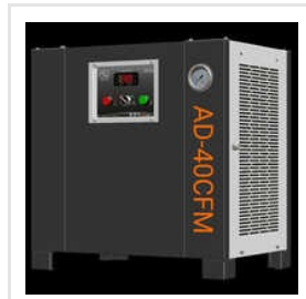
AD-40 CFM Refrigeration Air Dryer