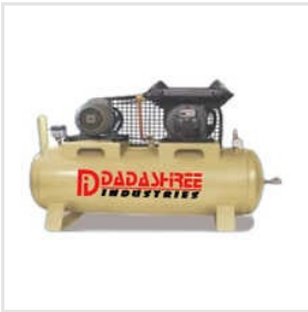
Industrial Vacuum Pump