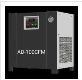
AD-100 CFM Refrigeration Air Dryer