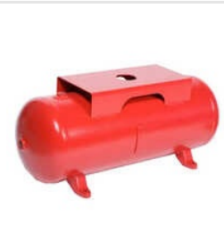
Air Receiver Tank