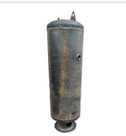
Vertical Air Receiver Tank