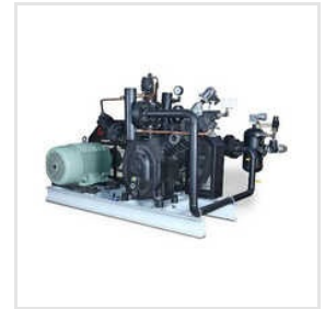
Booster Air Compressor