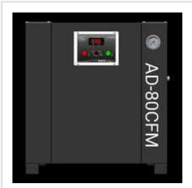
AD-80 CFM Refrigeration Air Dryer