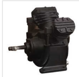
3HP Cylinder Head Block