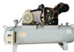
HIGH PRESSURE AIR COMPRESSOR