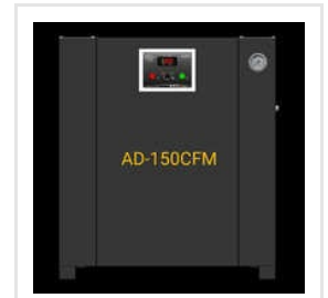
AD-150 CFM Refrigeration Air Dryer