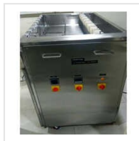
Ultrasonic Eight Roller Cleaning System