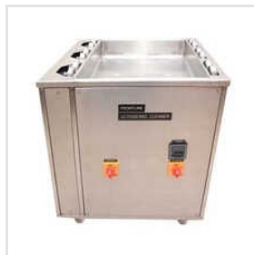
Ultrasonic Three Roller Cleaning System