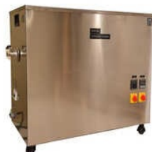
ULTRASONIC CLEANER FOR ROBOTIC ARMS