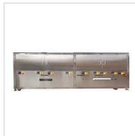
Multistage Ultrasonic Cleaner Machine