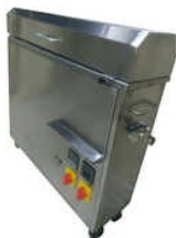
ULTRASONIC SINGLE ROLLER CLEANING SYSTEM

Anilox Roller Cleaning Machine, Bacteriological Incubator, Biologics Ultrasonic Homogenizer, Bod Incubator, Constant Temperature Water Bath, Dissolution Rate Apparatus, Friability Test Apparatus, Humidity Chamber, Industrial Ultrasonic Cleaner, Laboratory Autoclaves, Laboratory Hot Air Ovens, Laboratory Sonicators, Laboratory Vacuum Ovens, Laboratory Water Bath, Probe Sonicators, etc.