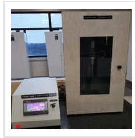
Sonicator Probe Type With Sound Abating