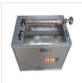
Ultrasonic Two Roller Cleaning System