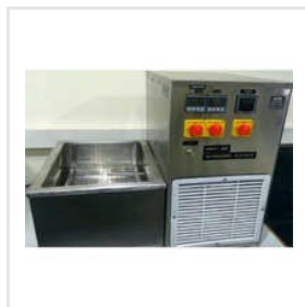
Table Top Ultrasonic With Chiller