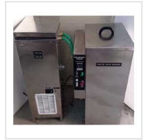
Small Vapour Degreaser Machine