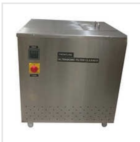
Ultrasonic Filter Cleaner