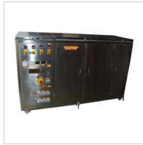
Automatic Vapour Degreaser Machine