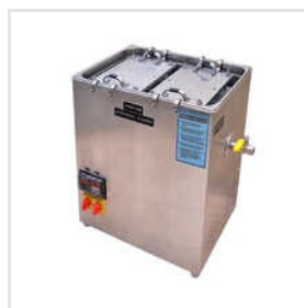
Ultrasonic LPG Wall Cleaner