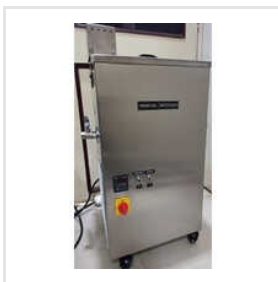
Automatic Refrigerated Water