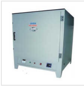
Automatic Hot Air Oven