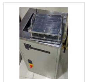
Ultrasonic LPG Wall Cleaner