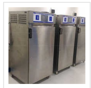
Automatic Stability Chamber