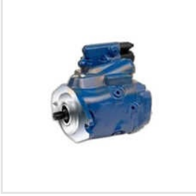
A10Vno 41 Rexrauth Hydraulic Pump