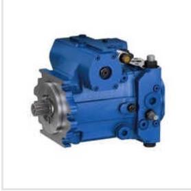
220v Electrically Operated Hydraulic