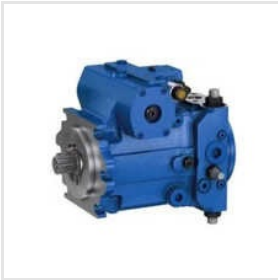
A4VG Rexrauth Hydraulic Pump