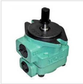
Yuken Y5 Hydraulic Van Pump