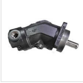
Hydraulic Axial Piston Motor