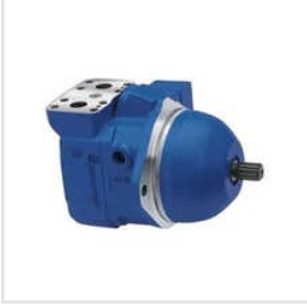
A10ve Rexroth Hydraulic Motor