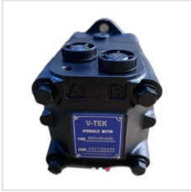
OMS Series Orbital Hydraulic Motor