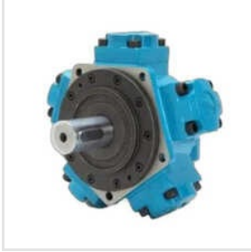
Intermot Hydraulic Motor