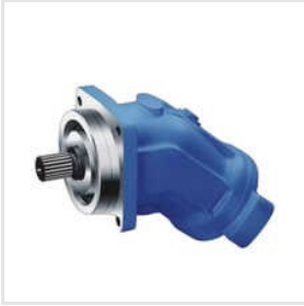
Rexroth Hydromatic Hydraulic Motor