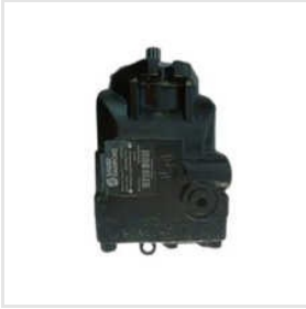
Series 45 Danfoss Hydraulic Pump