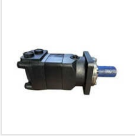
OMT Series Orbital Hydraulic Motor