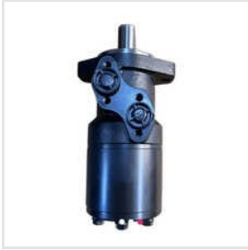
Omr Series Orbital Motor