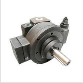
1 HP Hydraulic Motor