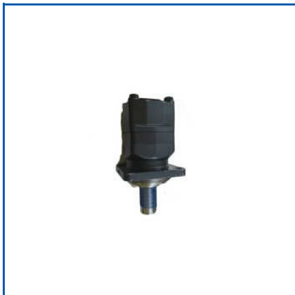
DANFOSS HYDRAULIC MOTOR

1 HP Hydraulic Motor, 10 HP JCB Hydraulic Pump, 2 HP Three Phase Dock Leveller Power Pack, 2 Port Mini Solenoid Valve, 220v Electrically Operated Hydraulic Pump, 230 V Danfoss Hydraulic Motor, 24 Watt Hydraulic Dc Power Pack, etc.