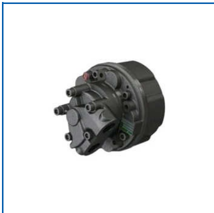
230 V DANFOSS HYDRAULIC MOTOR