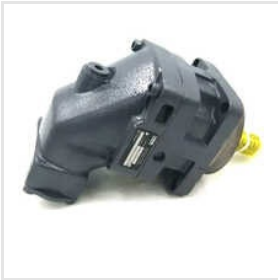
F12 040 Parker Hydraulic Pump