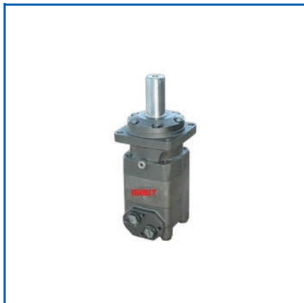
DANFOSS OMT 400 HYDRAULIC MOTOR