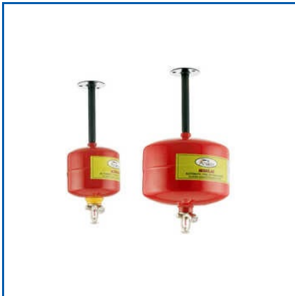
MODULAR FIRE EXTINGUISHER

Branch Pipe And Nozzle ISI Marked, C.I Draw Out Connection, Clean Agent Fire Extinguisher, Double Outlet Type Landing Valve Type B, Fire Blanket, Fire Bucket, Fire Man Suit, Fireman Axe, Foam Base Fire Extinguishers, G M Air Release Valve, G M Dividing Breeching, Hand Operated Siren, Hose Delivery Coupling ISI Marked, Hose Reel Drum, Landing Valve Single (Type A And Type B), etc.