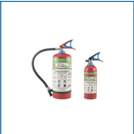
CLEAN AGENT FIRE EXTINGUISHER