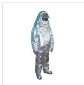
Fire Man Suit