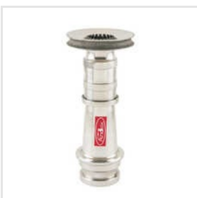
Triple Purpose Nozzle