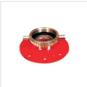
C.I Draw Out Connection