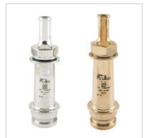
Branch Pipe And Nozzle ISI Marked