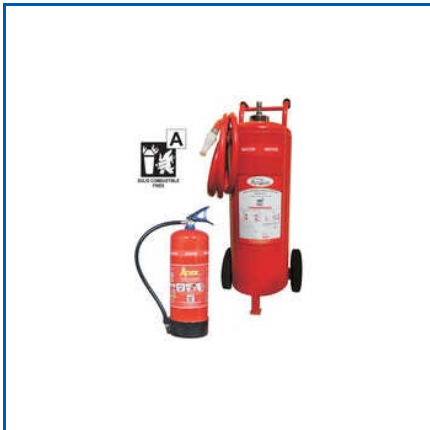
WATER BASE FIRE EXTINGUISHERS