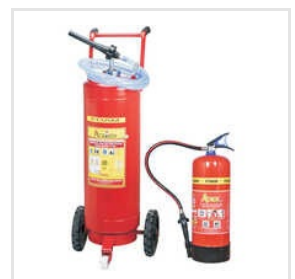
Foam Base Fire Extinguishers