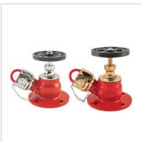
Landing Valve Single (Type A And Type B)