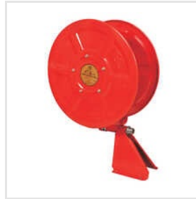
Hose Reel Drum