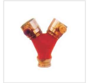
G M Dividing Breeching