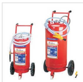
Trolley Mounted Fire Extinguisher