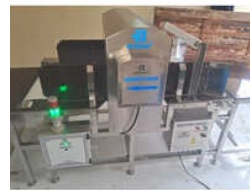
Metal Detector For Bags