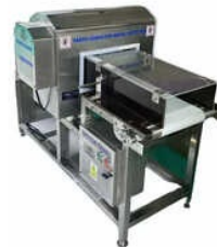
03_Bakery Conveyor Metal Detector