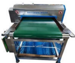
Textile Garment Conveyor Metal