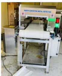
Dry Fruits Conveyor Metal Detectors