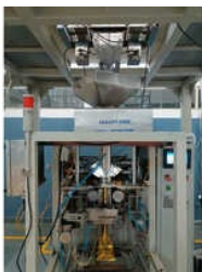
PARTH FFS LINE GRAVITY FEED METAL DETECTOR

01_Auto Rejection Conveyor Metal Detector, 01_Bakery Conveyor Metal Detector, 01_Sea Food Metal Detector, 02_Auto Rejection Conveyor Metal Detector, 02_Bakery Conveyor Metal Detector, 02_Sea Food Metal Detector, 03_Bakery Conveyor Metal Detector, 4 In 1 Tablet Tester Thickness Digmeter Hardness Weight, etc.