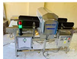
Parth Technologies Grain Conveyor Metal