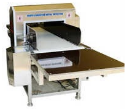
Dairy Product Conveyor Metal