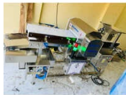
Metal Detector For Food Industries