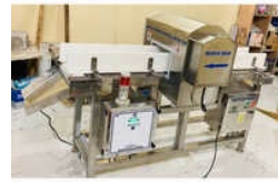
01_Auto Rejection Conveyor Metal