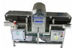
01_Bakery Conveyor Metal Detector