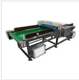
Stainless Steel Garment Metal