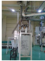
Online Gravity Feed Metal Detector