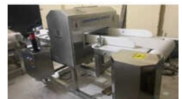
Pharmaceutical Conveyor Metal