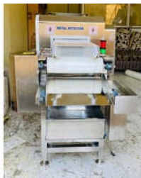
02_Auto Rejection Conveyor Metal