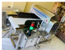
Food Metal Detector Conveyor