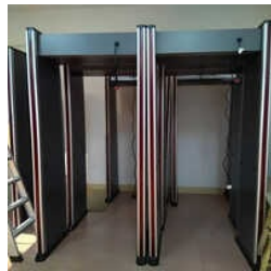
Door Frame Metal Detector