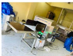
CONVEYOR METAL DETECTOR