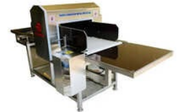
Carpet Conveyor Metal Detectors