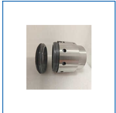
KSB PUMP SEAL