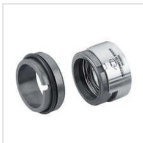
RM7 Wave Spring Seals