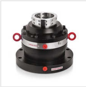
High Pressure Agitator Seal