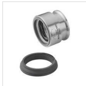
RM70 Spring Out Of Product Mechanical