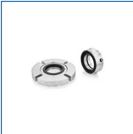
SINGLE DRY SEAL

API PLAN 53 Thermosyphon Pot, Acidic Application Teflon Bellow Seal, Agitator Double Seal With Api Plan 53 Vessel, Agitator Dry Seal, Agitator Single Wet Seal, Bearing Isolator, Boiler Fuel Pump Seal, Bunch Seals, Bush Bearings, Clinker Grinder Seal, Cooler Heat Exchanger, Double Agitator Seal, Double Back To Back Pump Seal, Double Cartridge Seal, Double Petro Chemical Seal, etc.