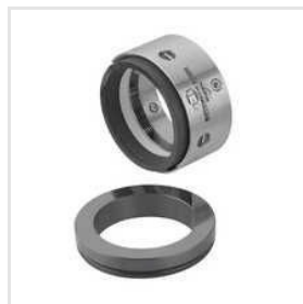
R58U Multi Spring Seals