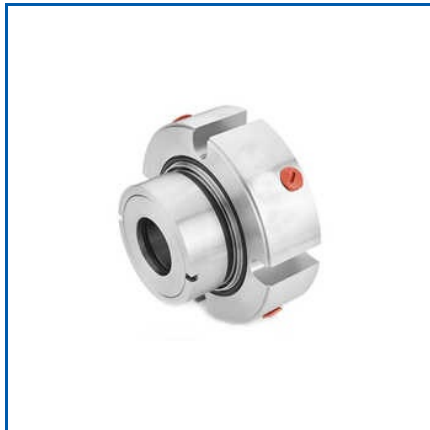
DOUBLE SLURRY SEAL