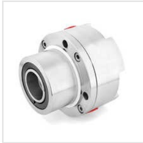
Double Back To Back Pump Seal