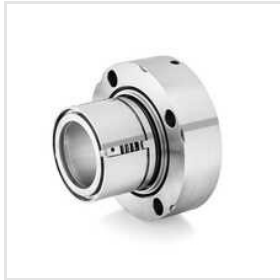
Boiler Fuel Pump Seal