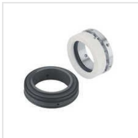
RB88 Reverse Balanced Multi Spring Seals