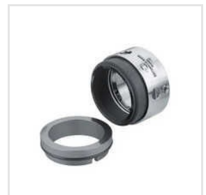
R58B Balanced Multi Spring Seals