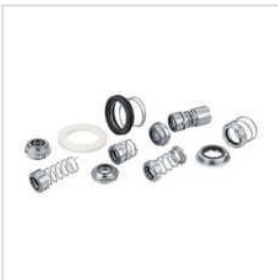
RB10 Industrial Pump Seals