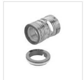
RS30 Parallel Spring Mechanical Seals