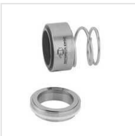
RC30 Conical Spring Seals