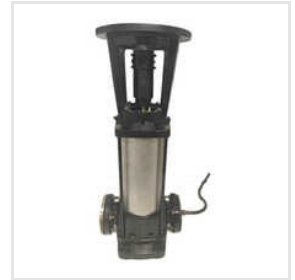
Kirloskar Inline Vertical Seal