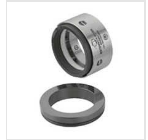
R58U Multi Spring Seals