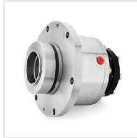
Sand Mill Seal