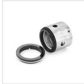
Single Spring Seal