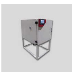
Digital Lab Oven