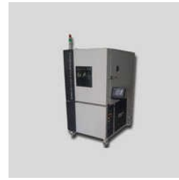
Environmental Climatic Chamber