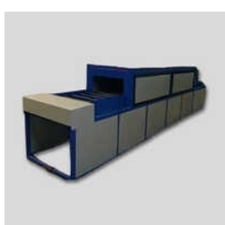
MS Conveyor Oven