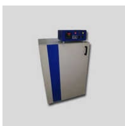
Mild Steel Bacteriological