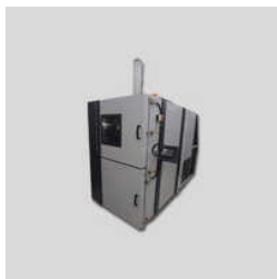
THERMAL SHOCK CHAMBERS

1800 Degree C Laboratory Furnaces, Automatic Muffle Furnances, Digital Lab Oven, Electric Industrial Oven, Electric Rotary Furnaces, Environmental Climatic Chamber, Environmental Test Chambers, Heating Oven, MS Conveyor Oven, Mild Steel Bacteriological Incubator, Mild Steel Tray Dryer, Ms Bod Incubator, PLC Lab Oven, Stailless Steel Drying Cabinets, Stainless Steel High Temperature Oil Bath, etc.