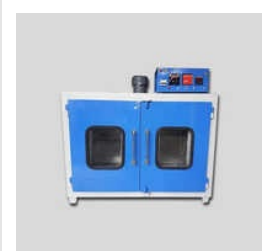
Mild Steel Tray Dryer