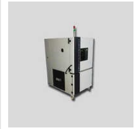
Environmental Test Chambers