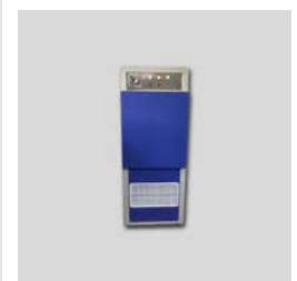
Ms Bod Incubator