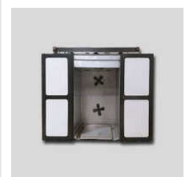
Electric Industrial Oven