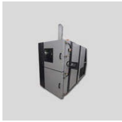
Thermal Shock Chambers