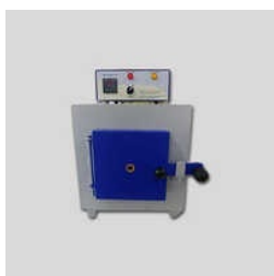
Automatic Muffle Furnances