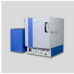
1800 Degree C Laboratory Furnaces