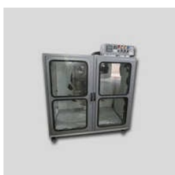
Stainless Steel Drying Cabinets