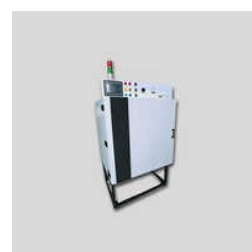
PLC Lab Oven