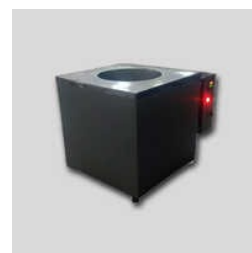
Stainless Steel High Temperature Oil Bath