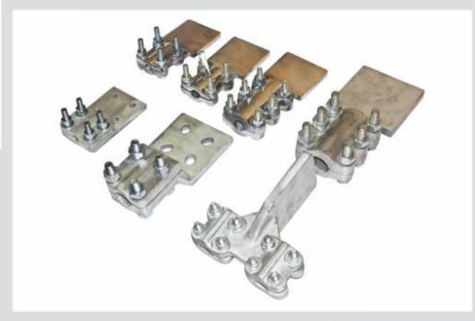
ISOLATOR PAD CONNECTORS