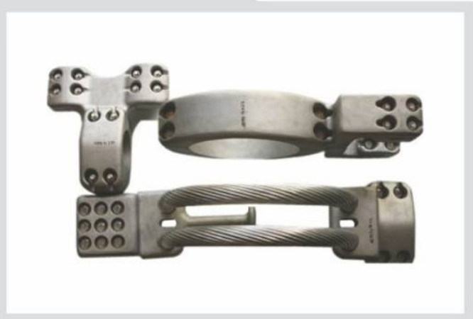
IPS TUBE CONNECTORS