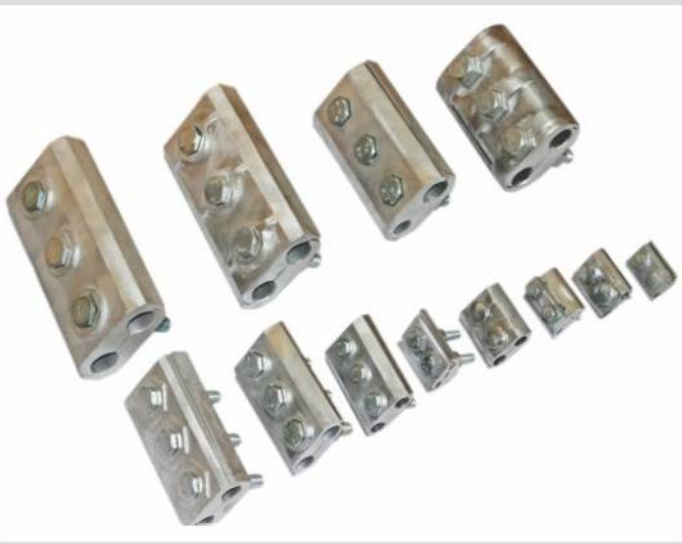
Parallel Groove Clamps