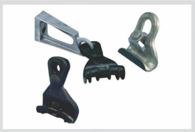
AB CABLE ACCESSORIES