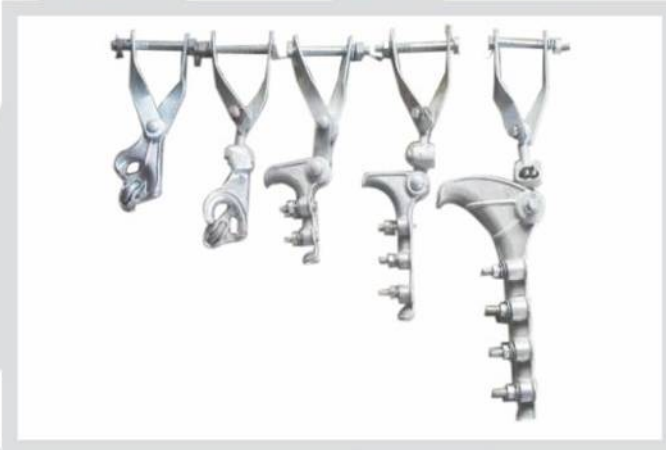
HARDWARE/ TENSION FITTING