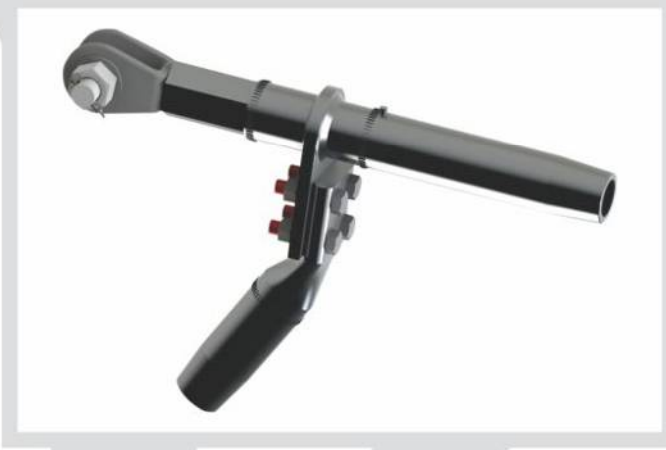
COMPRESSION DEAD END CLAMP