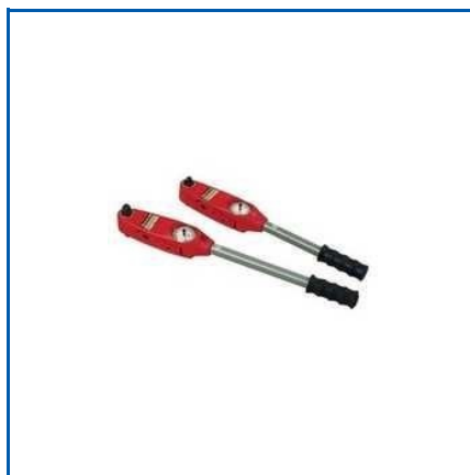
DIAL TYPE TORQUE METER