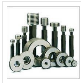
Thread Plug And Ring Gauge