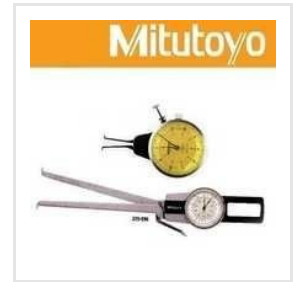
Internal Groove Caliper Gauge