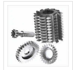
Gear Hob Cutters