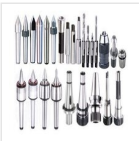
Cnc Tools Accessories