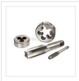
HSS TAPS AND DIES