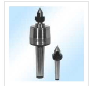
CNC Re Volving Centres