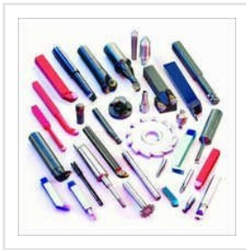
Brazed Carbide Tipped Tools