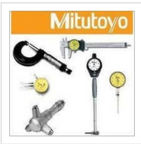
Bore Gages And Depth Micrometer