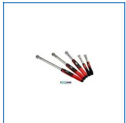
MANUAL TORQUE WRENCHES