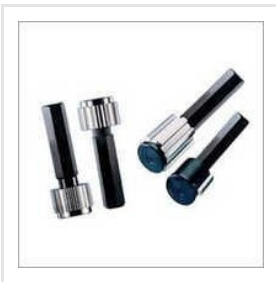
Plain Plug And Ring Gauges