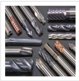
Solid Carbide Cutting Tools