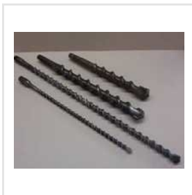
Carbide Drill Bit