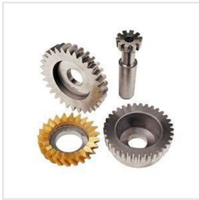
Gear Shaper Cutter