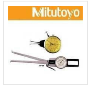
Internal Groove Caliper Gauge