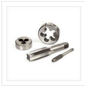
HSS TAPS AND DIES