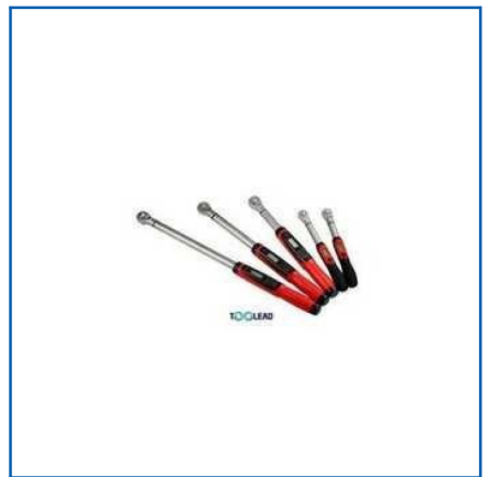
MANUAL TORQUE WRENCHES