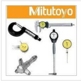
Bore Gages And Depth Micrometer