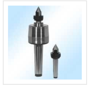
CNC Re Volving Centres