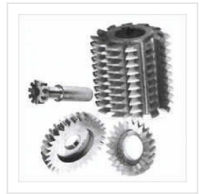
Gear Hob Cutters