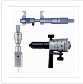
Precision Measuring Instrument