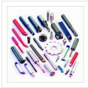
Brazed Carbide Tipped Tools