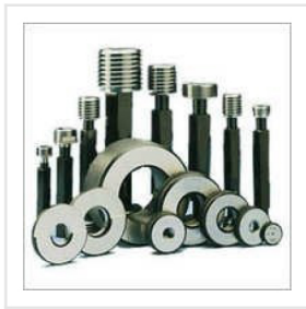
Thread Plug And Ring Gauge