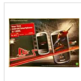
Mobile Promotional Poster