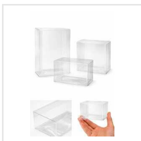
Transparent PVC Boxes