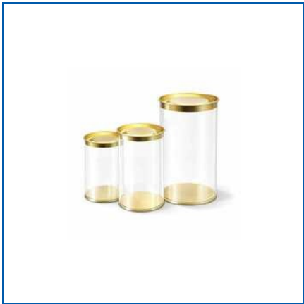
CLEAR TIN JARS

Blister Packaging, Blister Trays, Clamshell Blister, Clear Squeeze Box, Clear Tin Jars, Dink Promotional Poster, Electronics Product Promotional Poster, Garments Packiging Box, God Promotional Poster, HIPS Velvet Tray, Hanging Display, Hanging Transparent Pet Boxes, Highlighter Pen Stand Display, Mobile Promotional Poster, POSM Hanging Display, etc.