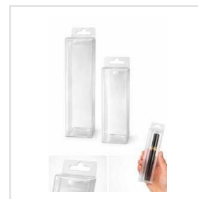
Hanging Transparent Pet Boxes