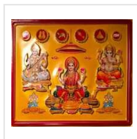
God Promotional Poster