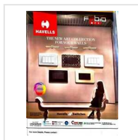
Electronics Product Promotional Poster