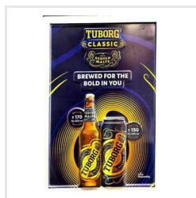
Dink Promotional Poster