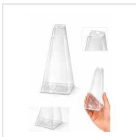
Transparent Pet PVC Boxes