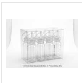
Clear Squeeze Box