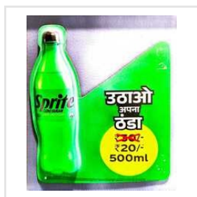
Soft Drink Promotional Poster