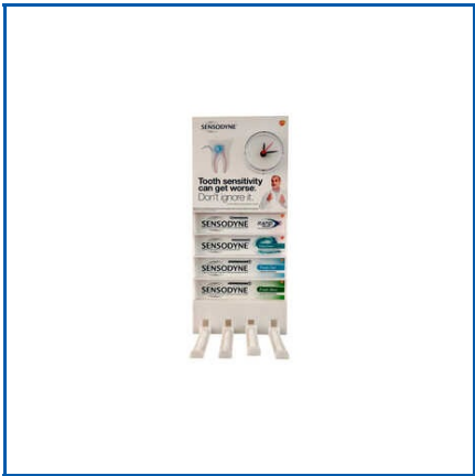
POSM HANGING DISPLAY