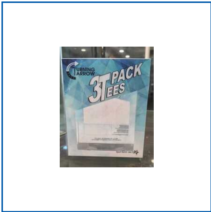
GARMENTS PACKIGING BOX