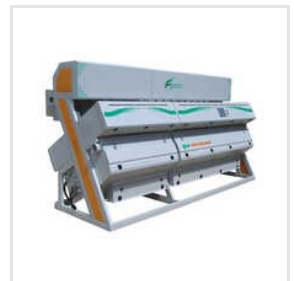
Automatic Wheat Sorting Machine