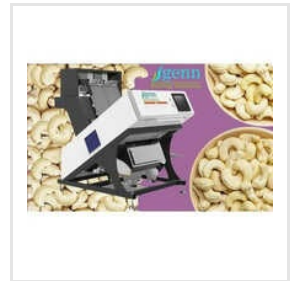
Cashew Nut Color Sorting Machine