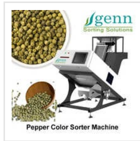
Green Pepper Color Sorting Machine