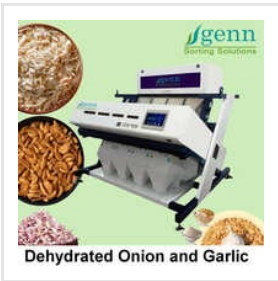
Dehydrated Garlic Color Sorting Machine