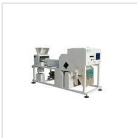
2.5KVA Steel Garlic Sorting Machine