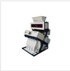
5 HP Dal Color Sorting Machine