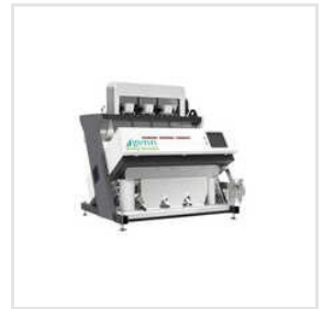
Cereals Color Sorting Machine