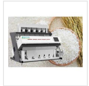
Basmati Rice Colour Sorting Machine