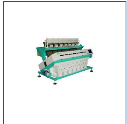
4 TON RICE SORTING MACHINE