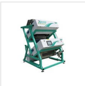
Green Tea Color Sorting Machine