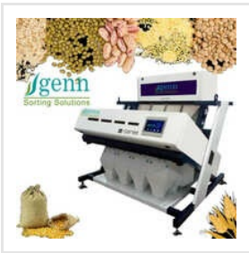
Magaj Color Sorter Machine