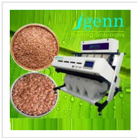
Rose Rice Color Sorting Machine