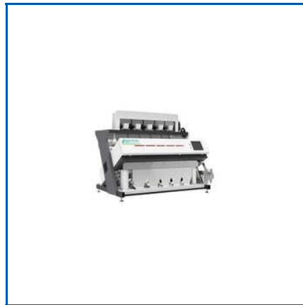
GRAIN COLOR SORTER MACHINE