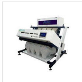
Poha Color Sorting Machine