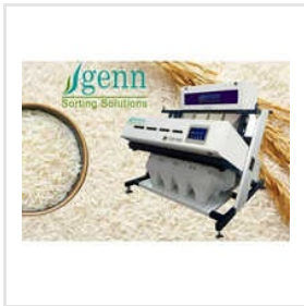
Double Boiled Rice Color Sorting Machine