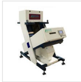
220 V Color Sorter Machine