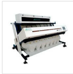
Toor Dal Color Sorter Machine