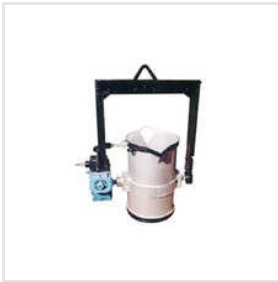
Cast Iron Geared Tilting Ladles