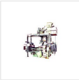
Industrial Four Station Automation Shell