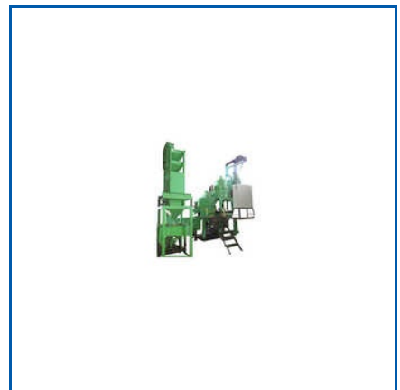
INDUSTRIAL SOLID RESIN SAND COATING PLANT