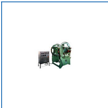
INDUSTRIAL SWING DOOR TYPE AUTOMATIC SHELL CORE SHOOTER

Automatic Shell Core Shooter, Cast Iron Geared Tilting Ladles, Diesel Sand Dryers, Industrial Cold Box Type Core Shooter, Industrial Four Station Automation Shell Moulding Machine, Industrial Solid Resin Sand Coating Plant, Industrial Swing Door Type Automatic Shell Core Shooter, etc.