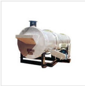
Diesel Sand Dryers