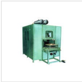
Industrial Cold Box Type Core Shooter