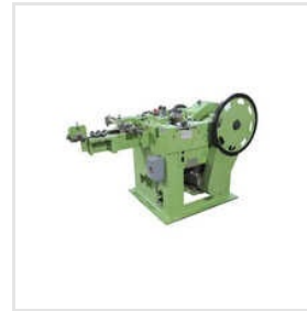
Automatic Wire Nail Making Machine