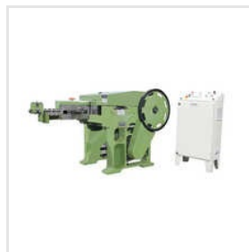
Automatic Nail Making Machine