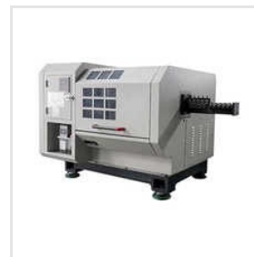
Automatic High Speed Nail Making Machine