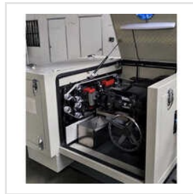
Ghsn90 High Speed Nail Machine