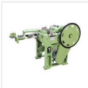
Gn2 Wire Nail Making Machine