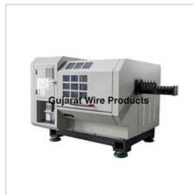
Iron Nail Making Machine