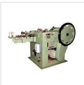
3 HP 3 Phase Wire Nail Making Machine