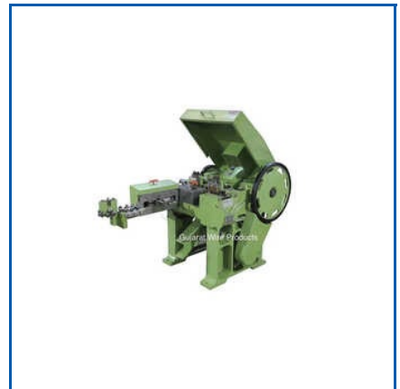
N3 AUTOMATIC HIGH SPEED NAIL MAKING MACHINE