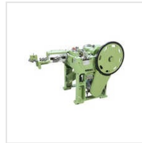
Fully Automatic Wire Nail Making Machine