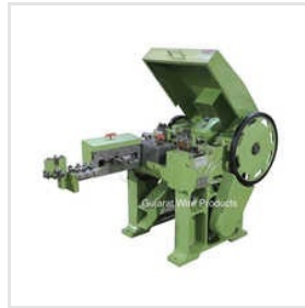
Steel Nail Making Machine