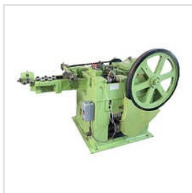
Gn4 Wire Nail Making Machine