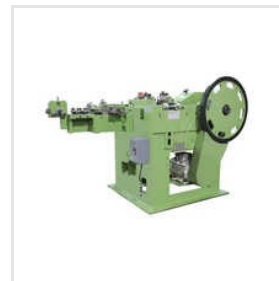
Wire Nail Making Machine