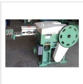
Ghs500 Nail Making Machine