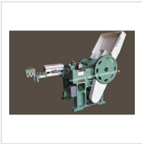
Industrial Nails Making Machine