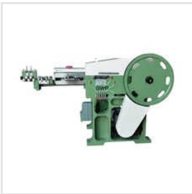
High Speed Nail Making Machine