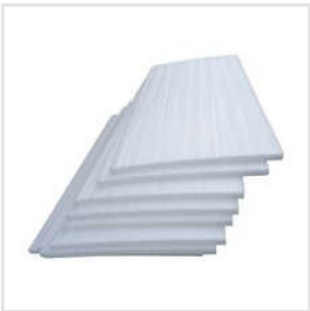
Mattress Hitlon EPE Foam