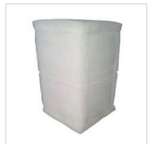
EPE Foam Packaging Box