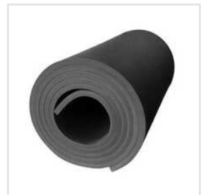
10 MM EPE Foam Roll