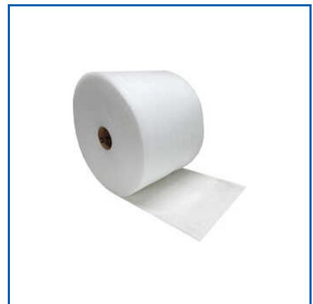
3 MM EPE FOAM ROLL