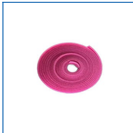
ESD EPE FOAM ROLL