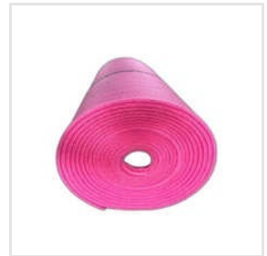
Pink EPE Foam Rolls