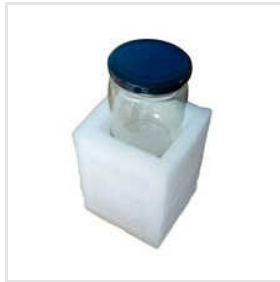
White EPE Foam Packaging Box