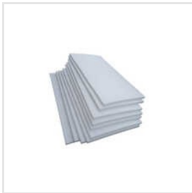
Floor Guard EPE Foam