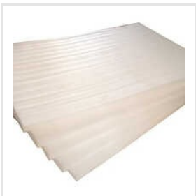
35 MM EPE Foam Sheet