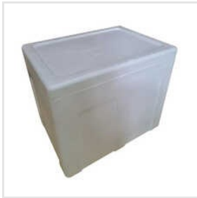
Rectangular Foam Box