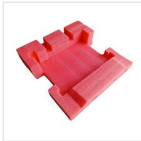
Anti Static EPE Foam Fitment