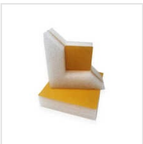
White EPE Foam Angle