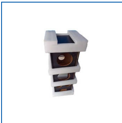
RECTANGULAR EPE FOAM FITMENTS

1 KG HMHD Bag, 10 MM EPE Foam Roll, 100 Meter Pink Air Bubble Roll, 100 Meter White Air Bubble Roll, 2 Layer Air Bubble Bag, 2 Layer Air Bubble Roll, 25 MM EPE Foam Sheet, 3 MM EPE Foam Roll, 35 MM EPE Foam Sheet, 5 MM EPE Foam Roll, 6 MM EPE Foam Roll, 7 MM EPE Foam Roll, 7 X 8 Inch Air Bubble Bag, 80 Meter Air Bubble Roll, Anti Static Air Bubble Bag, etc.