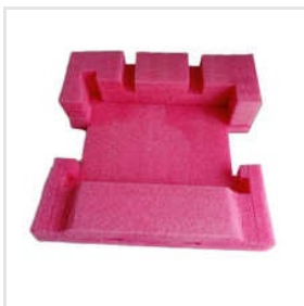
Anti-Static EPE Fitment Foam