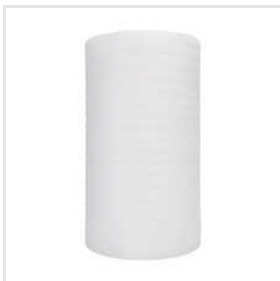
7 MM EPE Foam Roll