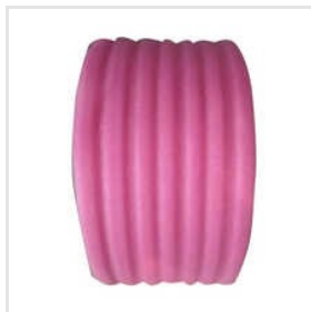
Customized Anti-Static EPE Foam