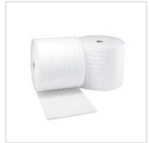
5 MM EPE Foam Roll