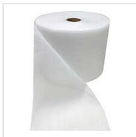
6 MM EPE Foam Roll