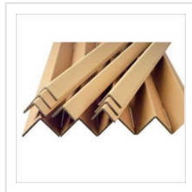
EDGE Plain Protector