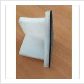
EPE L Corner Foam