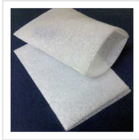
Plain Laminated Foam Bag