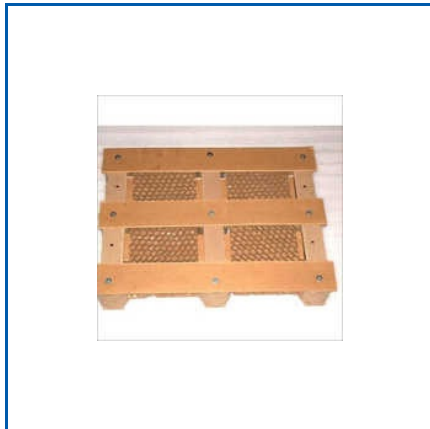
BROWN EDGE PROTECTORS