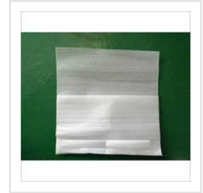
EPE Laminated Pouch