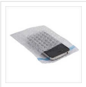
Air Bubble Film PCS