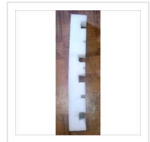
EPE Foam Block Fitment