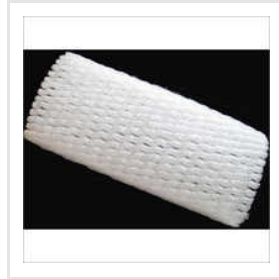
EPE Foam Fruit Nets