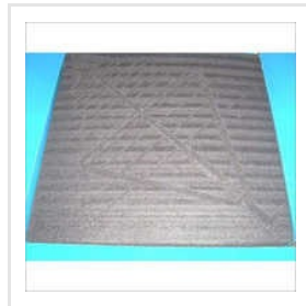
EPE Packaging Bag