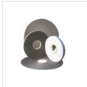
Eva Foam Strips