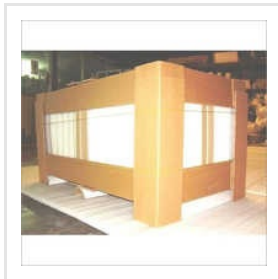
EDGE Cardboard Protectors