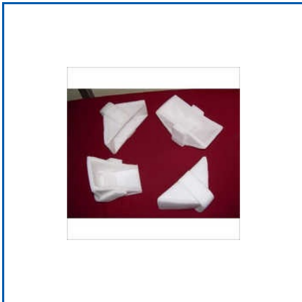
WHITE EPE FOAM CORNERS

Air Bubble Film Bag, Air Bubble Film PCS, Air Bubble Film Roll, Air Bubble Packing Roll, Angle Board, Angle Board Pallet, Angle Board Panel Packing, Anti Static Air Bubble Pouch, Anti Static Air Bubble Roll, Black EDGE Protector Guard, Brown Edge Protectors, Cardboard Edge Protectors, Coil Packing, Cold Insulation Foam Sheet, Corner Edge Protector, etc.