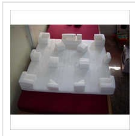
White EPE Foam