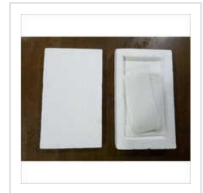
EPE Self Adhesive Sheets