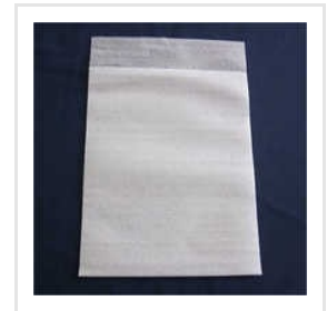
EPE Laminated Foam Cover