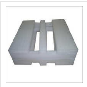
EPE Fitments Foam