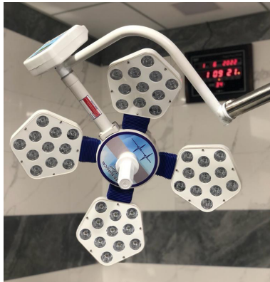
LED LIGHT DOME