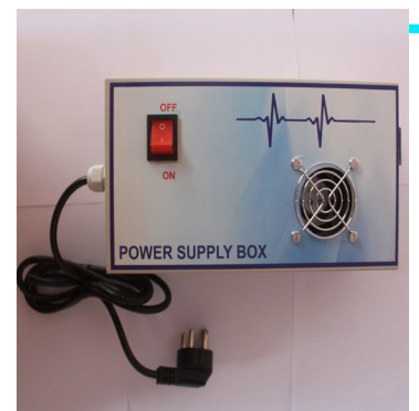
POWER SUPPLY BOX