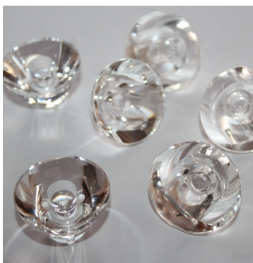
HD OPTICS LENSE