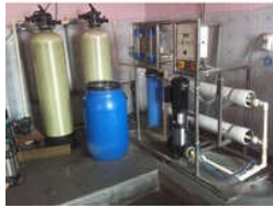
500lph Reverse Osmosis Systems