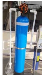
Automatic Reverse Osmosis Systems