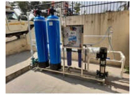
Multigrade Sand Filter Water Reverse