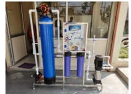
250lph Reverse Osmosis Systems