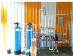
1000 LPH Reverse Osmosis System