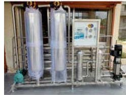
SS304 Reverse Osmosis Systems