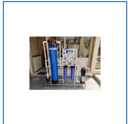
250L FRP REVERSE OSMOSIS SYSTEMS