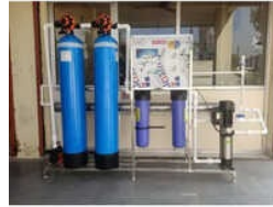
500LPH RO Reverse Osmosis Systems