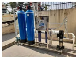
2000 LPH Reverse Osmosis System