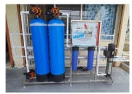
Industrial Reverse Osmosis Systems