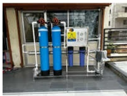
500lph Water Reverse Osmosis Systems