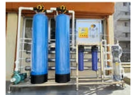
5kw Reverse Osmosis Systems