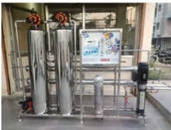
1000 LPH Water Reverse Osmosis