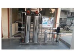
1000LPH Stainless Steel Reverse Osmosis