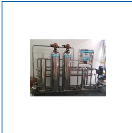
500 LPH STAINLESS STEEL REVERSE OSMOSIS SYSTEMS