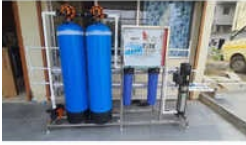
1000 LPH PVC Reverse Osmosis Systems