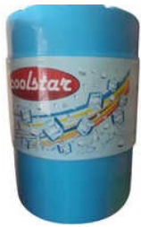
20L Coolstar Water Jar