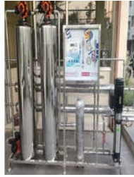
1000LPH SS Industrial Reverse Osmosis