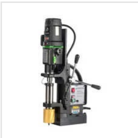
Magnetic Core Drill Machine