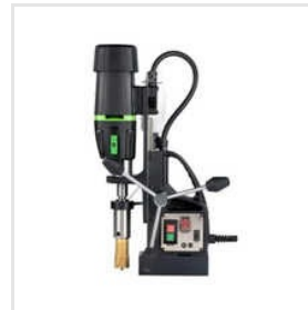
Magnetic Core Drill Machine