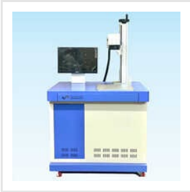
Cabinet Type Laser Marking Machine