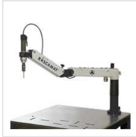
Roscamat 400 M2-M24 Pneumatic Flexible