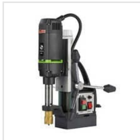
Magnetic Core Drill Machine