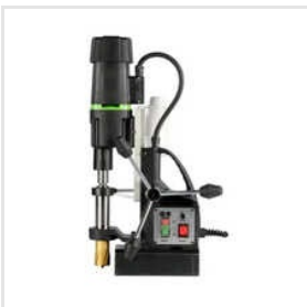
Magnetic Core Drill Machine