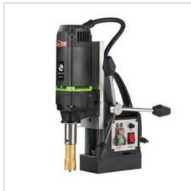
Magnetic Core Drill Machine