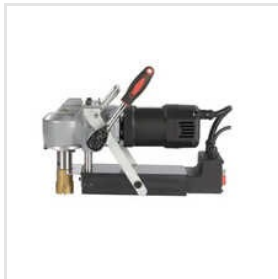
Magnetic Core Drill Machine