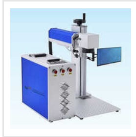
Movable Table Top Laser Marking Machine