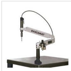
Roscamat 200 M2-M14 Pneumatic Flexible