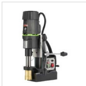
Magnetic Core Drill Machine