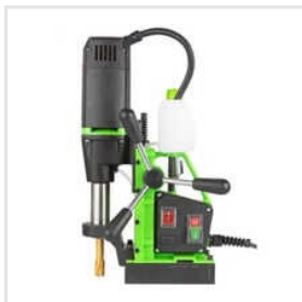
Magnetic Core Drill Machine