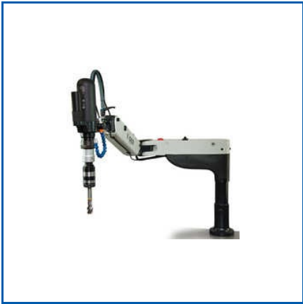
M2-M27 TIGER ELECTRIC FLEXIBLE ARM TAPPING MACHINE