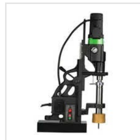
Magnetic Core Drill Machine