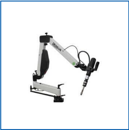
M2-M27 DRAGON ELECTRIC FLEXIBLE ARM TAPPING MACHINE