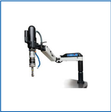
M3-M36 SHARK ELECTRIC FLEXIBLE ARM TAPPING MACHINE

Bilz Make CNC Tool Holders And M-C Tap, Cabinet Type Laser Marking Machine, Diamond Core Drilling, Diamond Core Drilling Machine, Electric Flexible Arm Tapping Machine M3-M12, Electric Flexible Arm Tapping Machine M3-M16, Electric Flexible Arm Tapping Machine M6-M24, etc.