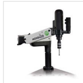
M2-M14 Mosquito Electric Flexible Arm