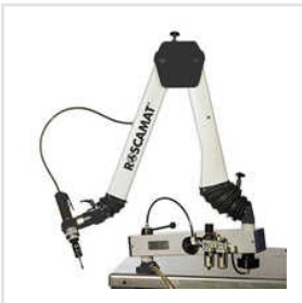
Roscamat 500RH M2-M24 Pneumatic